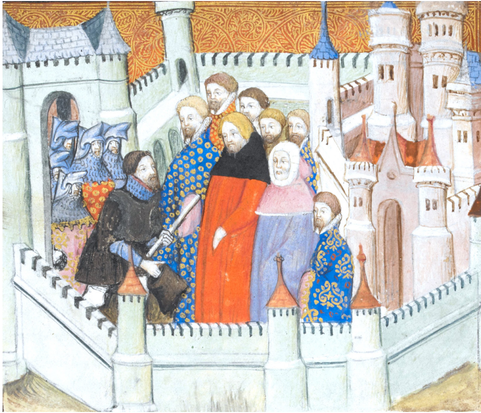
John Montagu, Earl of Salisbury*