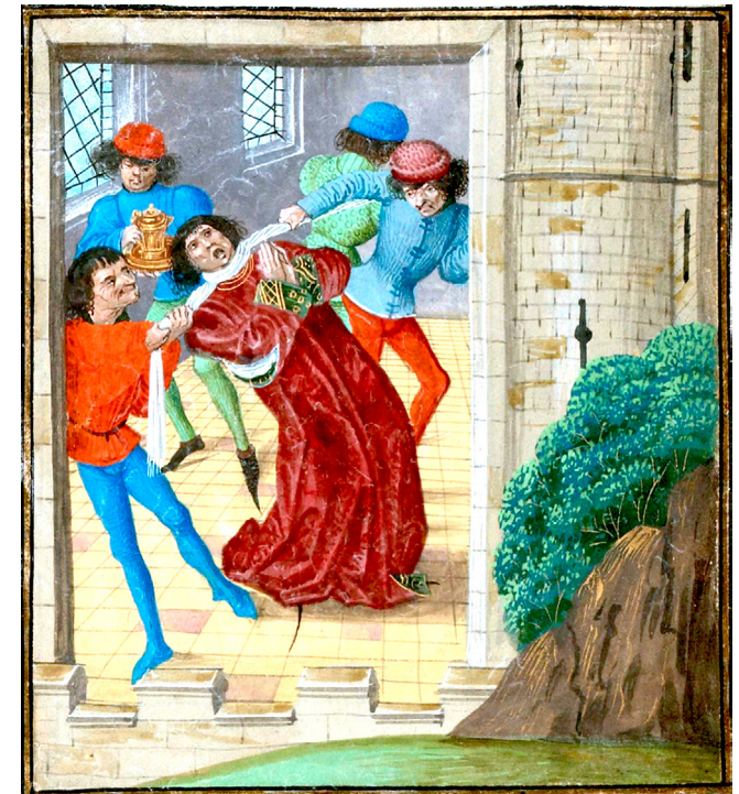
Murder of Thomas (15th)