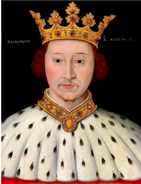
Richard II (U 16th) National Portrait Gallery