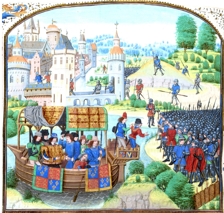
Death of Wat Tyler (15th C)