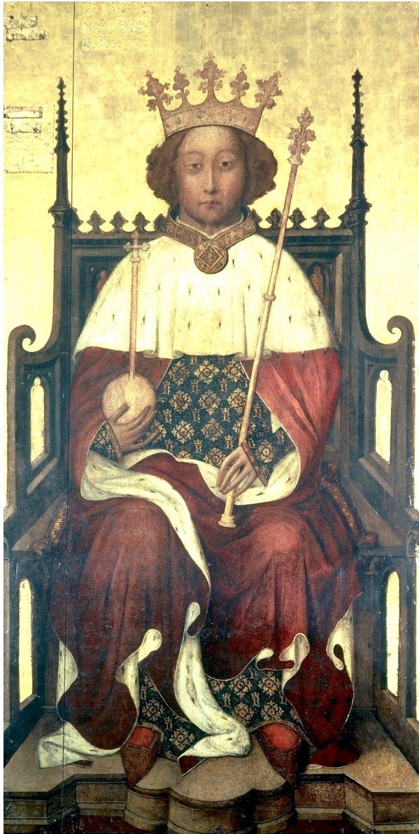
King Richard II (Beauneveu c1390s) Westminster Abbey