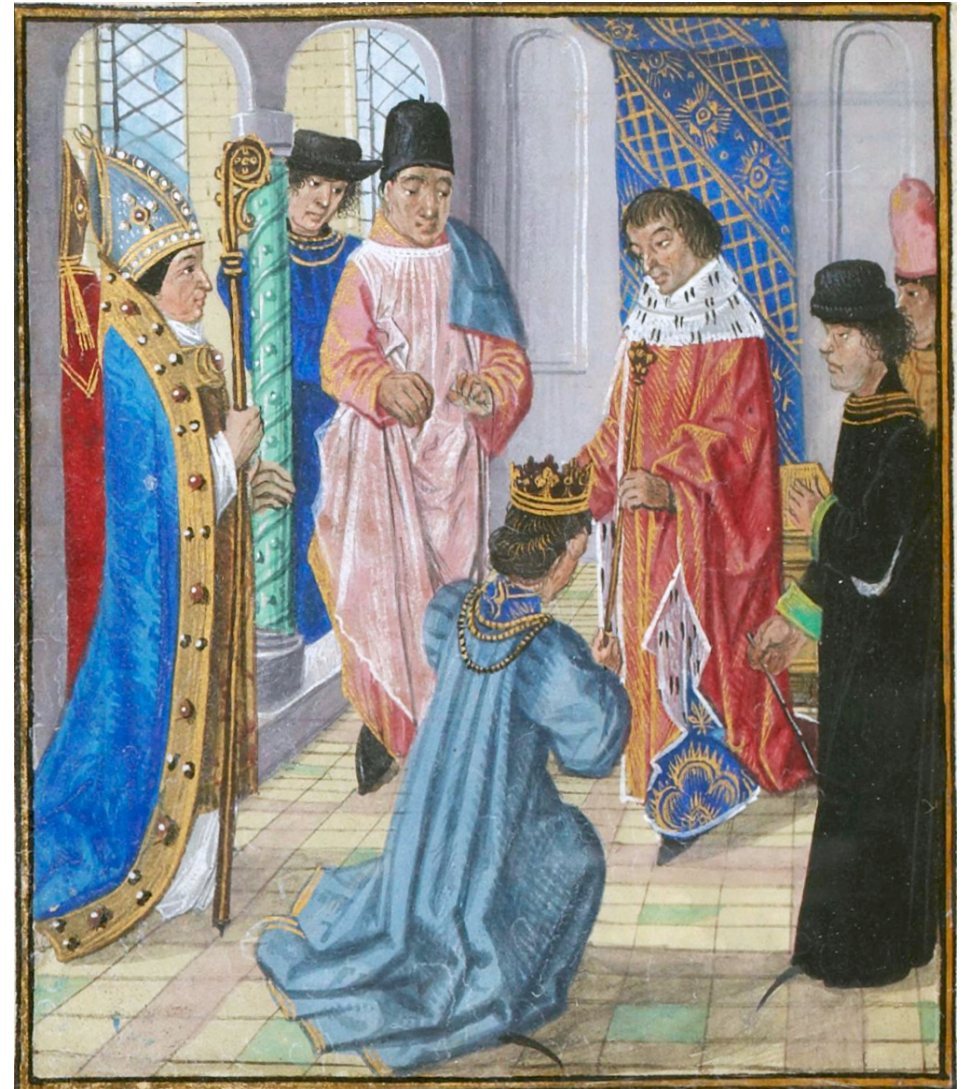
Abdication of Richard II (15th)