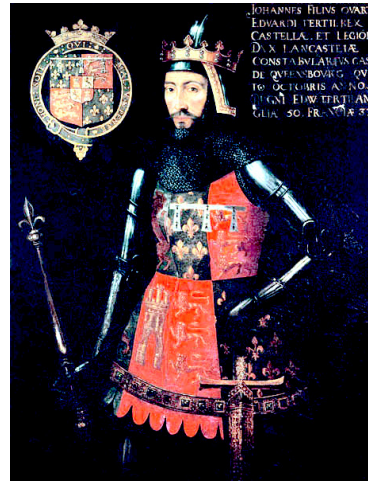
John of Gaunt (U 15th) CP