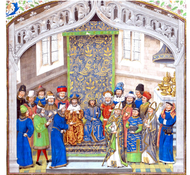
Coronation Richard II (15th)