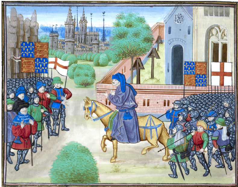
John Ball and Wat Tyler (15th)