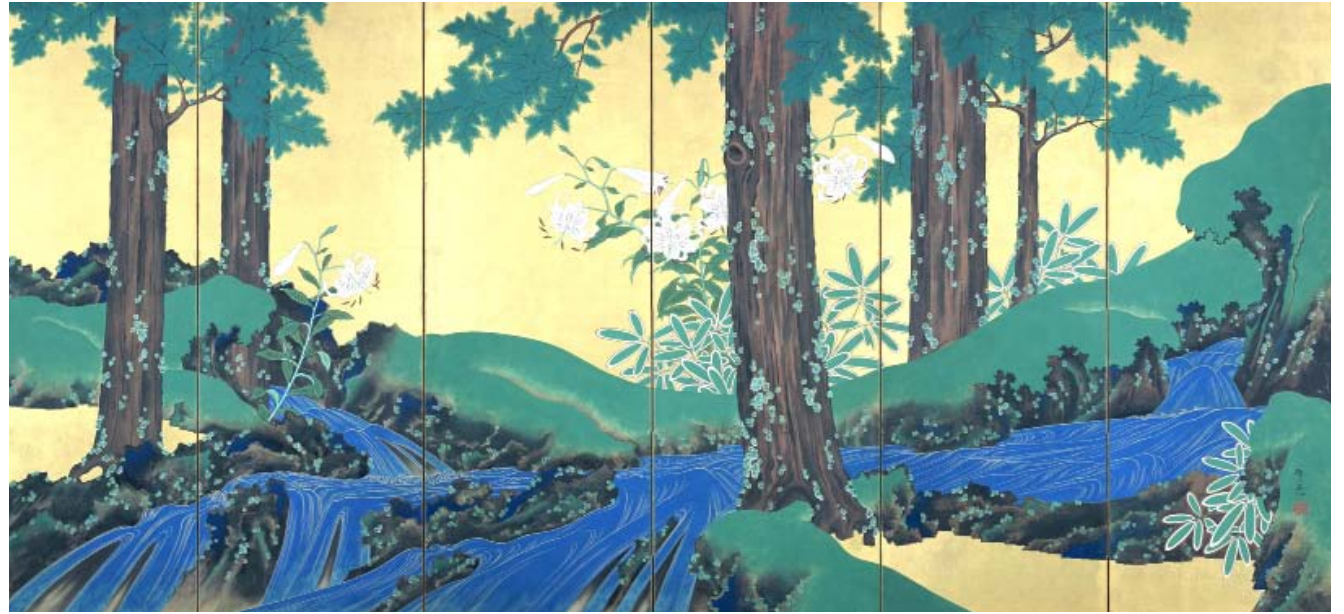
Mountain Streams in Summer and Autumn (19th C) Nezu Museum