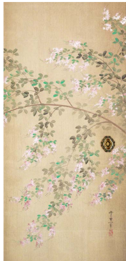
Moon with Bush Clovers/Wind God and Thunder God (19th) Tokyo Fuji Art Museum