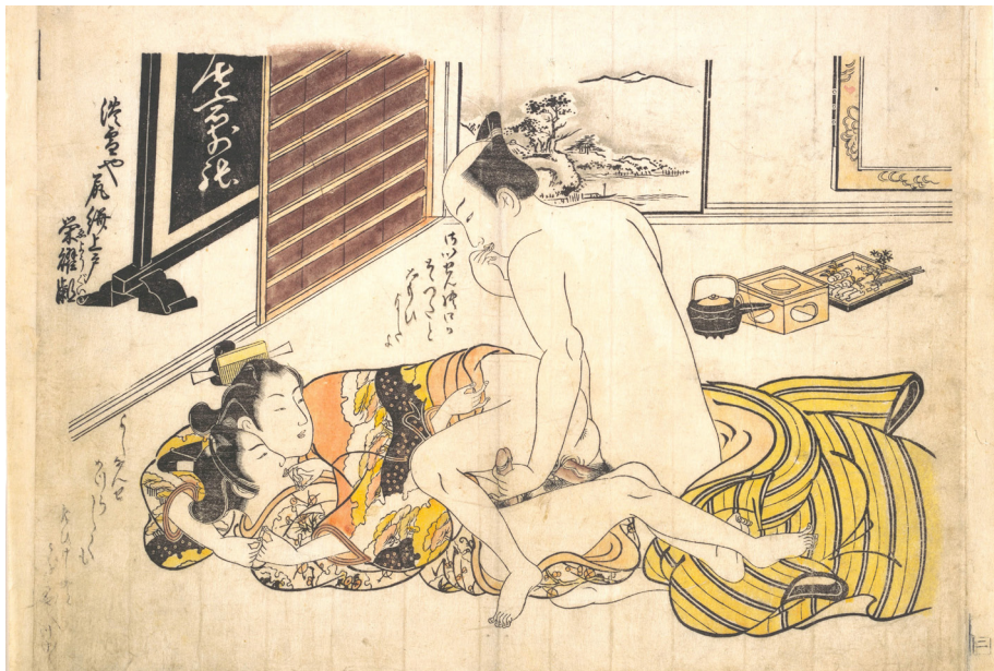
Okumura Masanobu 奥村 政信 (1686 – 1764)