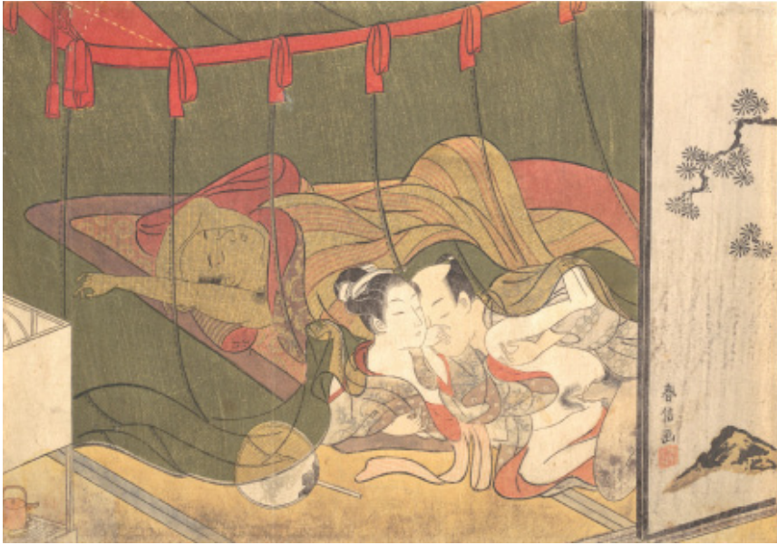
Suzuki Harunobu 鈴木 春信 (1725-1770)