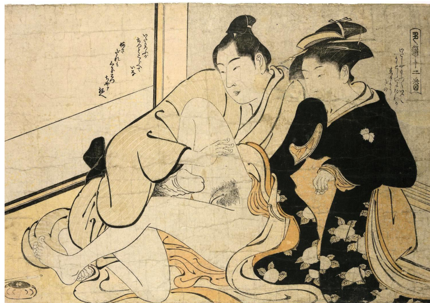
Torii Kiyonaga 鳥居 清長 (1752-1815)