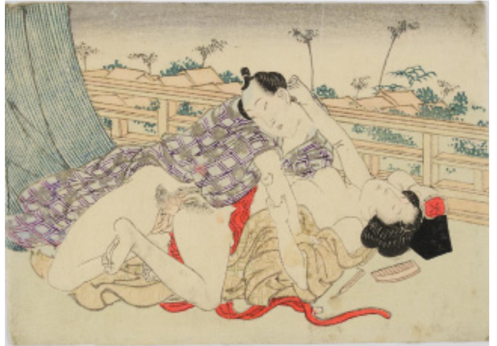
Keisai Eisen 溪斎 英泉 (1790–1848)