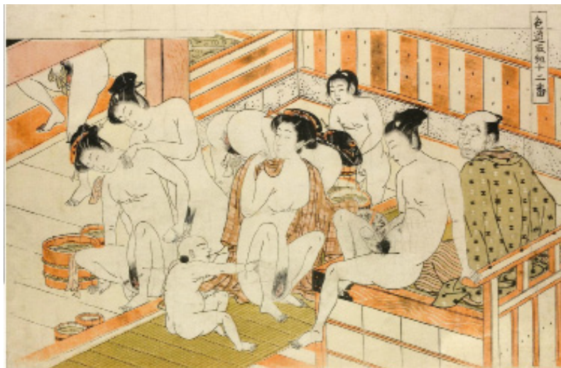
Isoda Koryūsai 磯田 湖龍齋 (1735-1790)