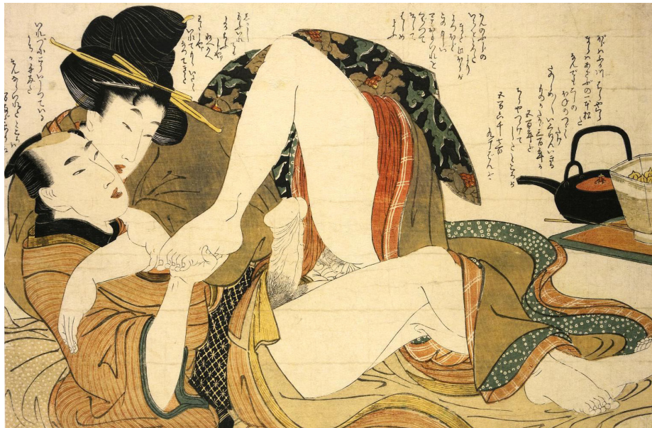
Kitagawa Utamaro 喜多川 歌麿 (1753-1806)