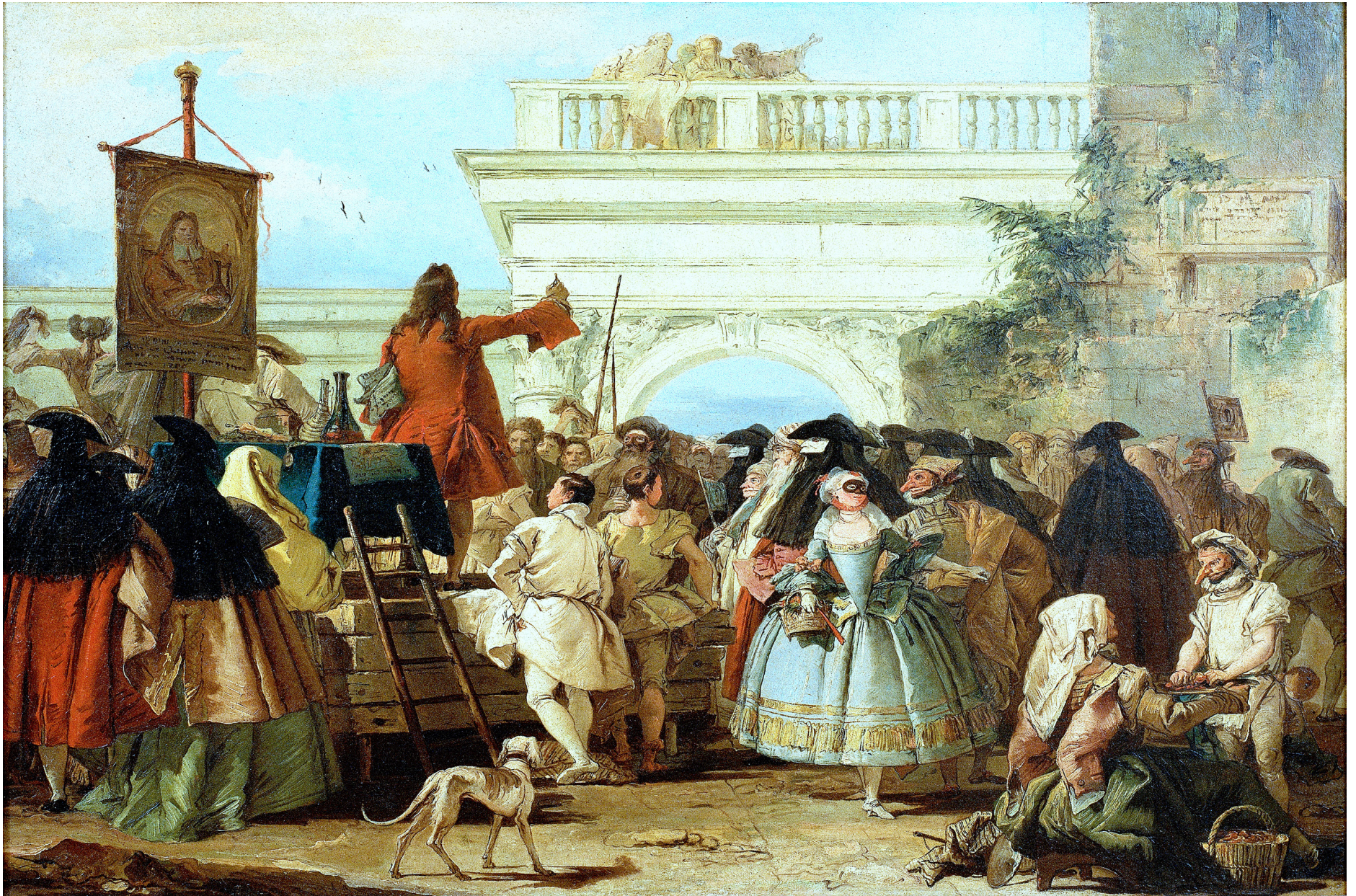
The Charlatan (1756) Museu Nacional d'Art de Catalunya