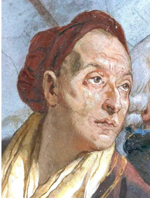
Self-Portrait (1750-53) Würzburg Residence