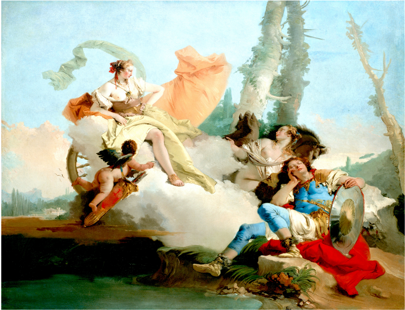
Rinaldo Enchanted by Armida (1742-45) Art Institute of Chicago