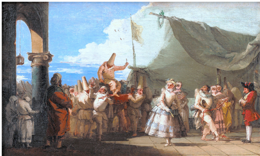
The Triumph of Pulcinella (1760-70) Statens Museum for Kunst