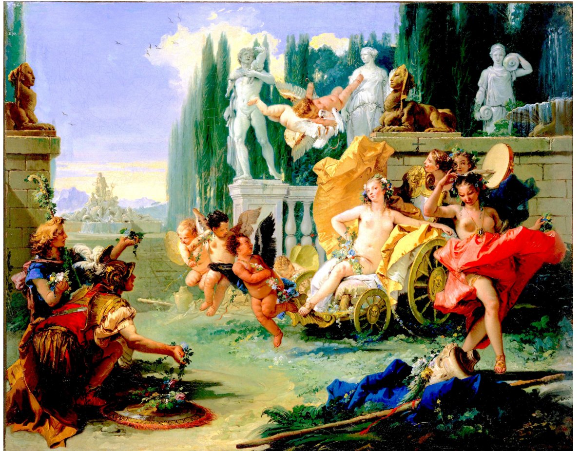
The Empire of Flora (c1743) Fine Arts Museums of San Francisco