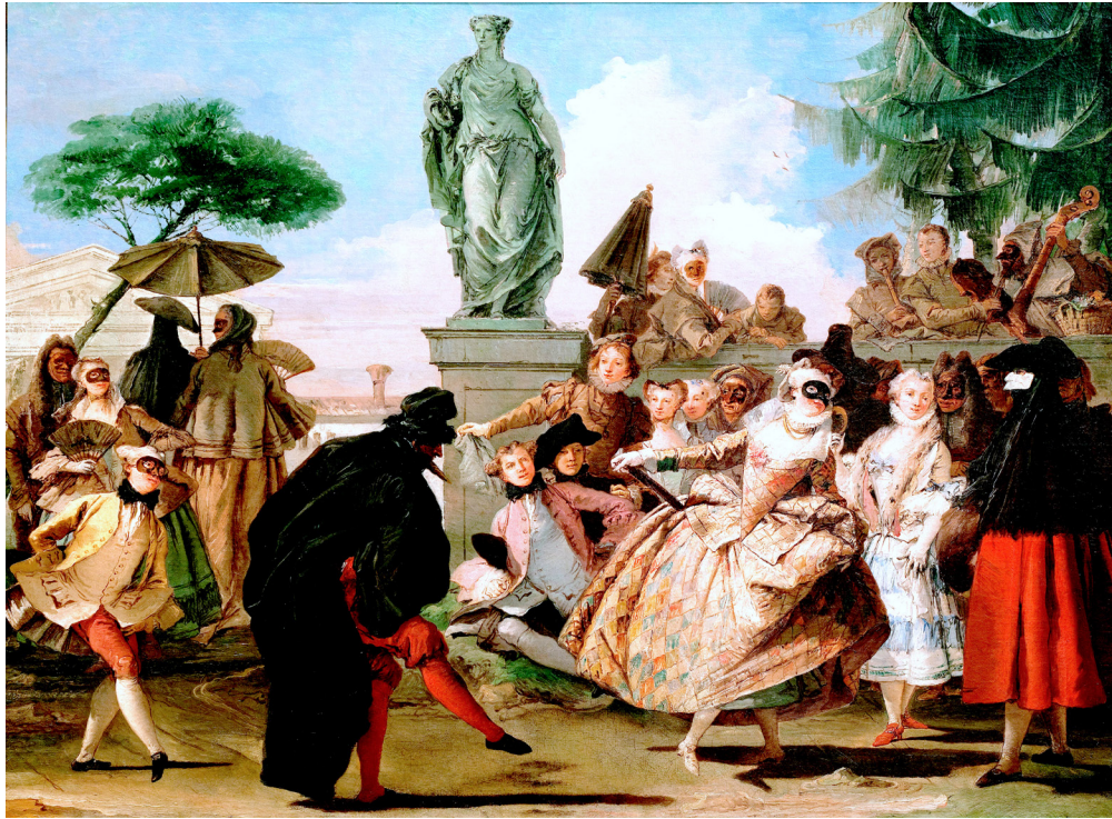
The Minuet (1756) Museu Nacional d'Art de Catalunya