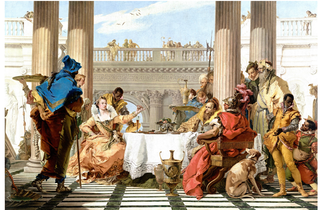
The Banquet of Cleopatra (1743-44) National Gallery of Victoria