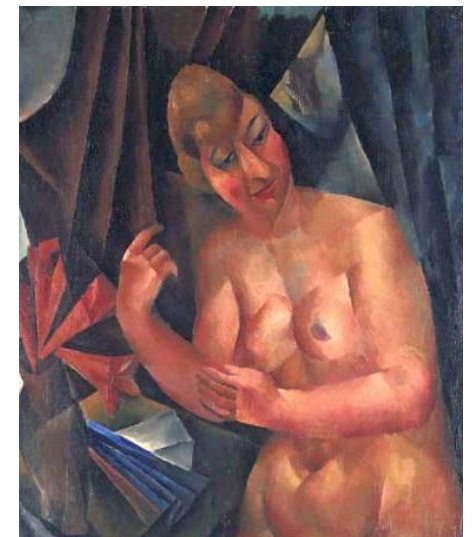
Nude blue interior (c1920) CP