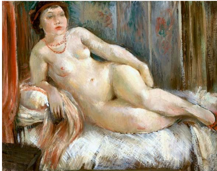
Reclining nude with a red necklace (c1925) CP