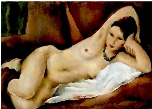
Nu allongé (c1925) CP