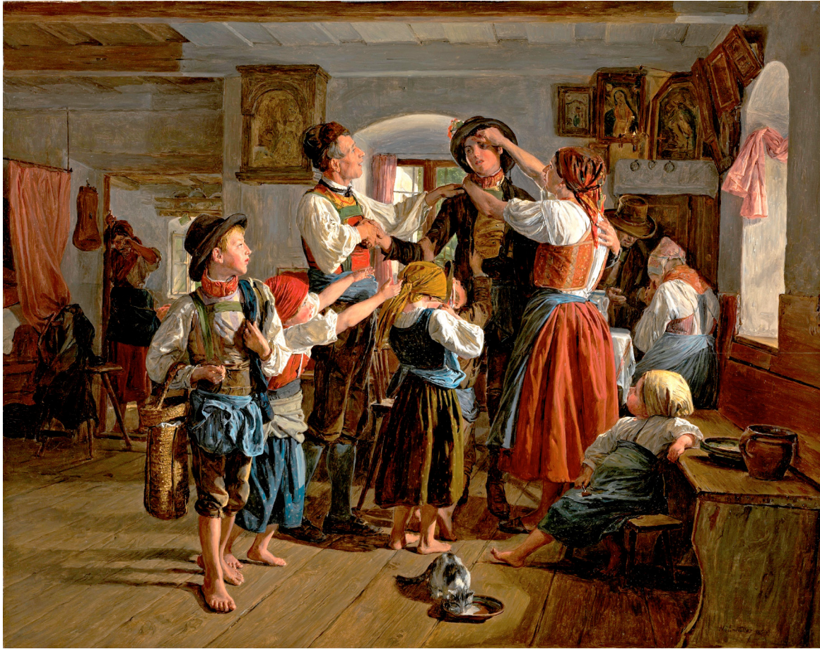
The Conscript's Farewell (1854) Leopold Museum