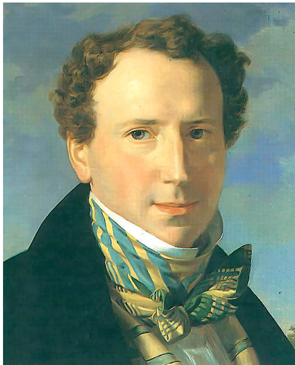
Self-Portrait (1828) Belvedere