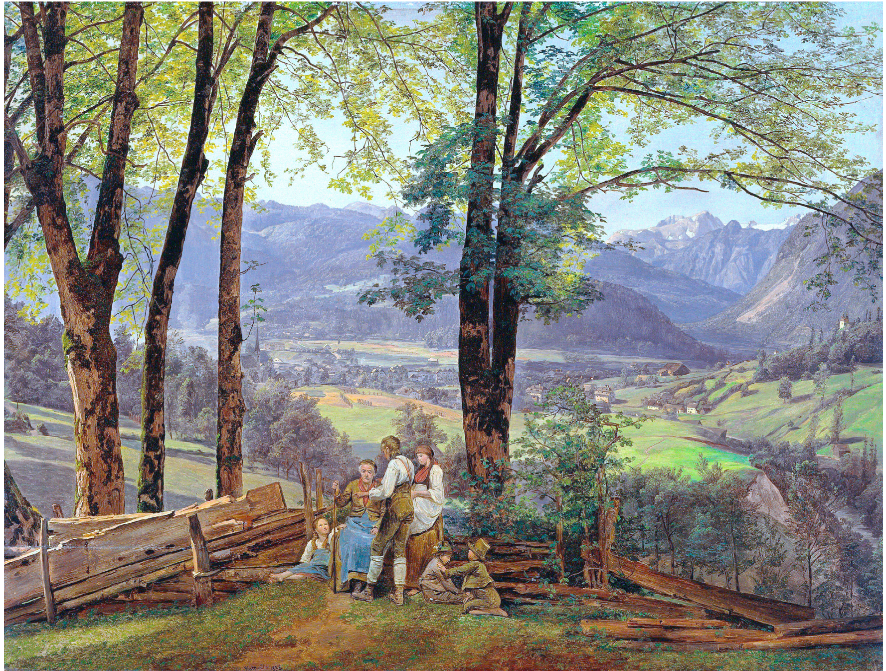
View of Ischl (1838) Alte Nationalgalerie