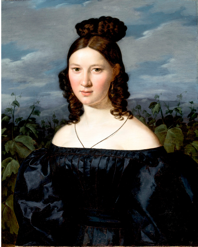
Young Woman (1820) National Museum in Warsaw