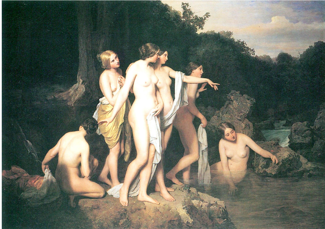
Women Bathing at a Brook (1848) CP