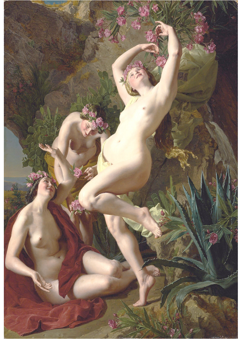
Three Graces Garlanded with Roses (1856) CP