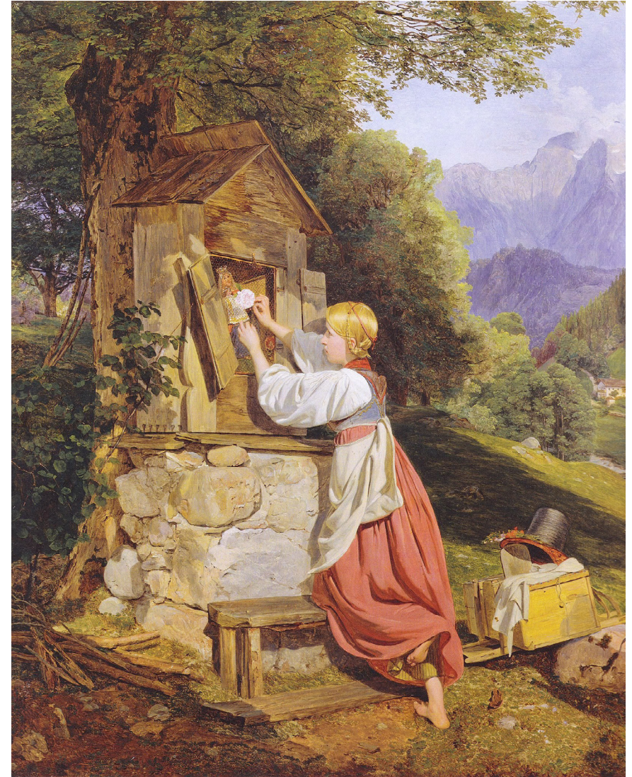
Girl Adorns the Virgin Mary with a Rose (1836) Belvedere