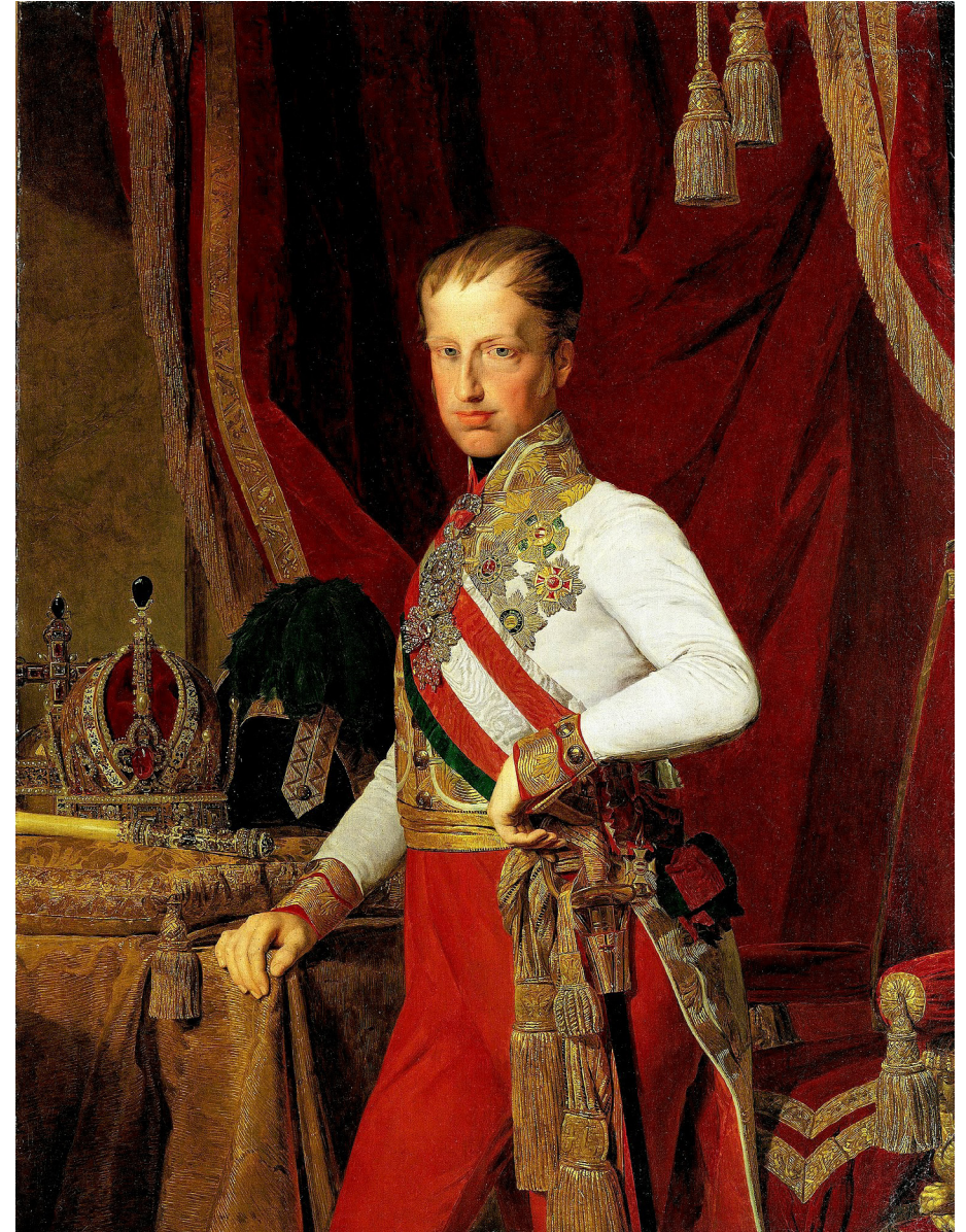
Emperor Ferdinand I (1839) Belvedere