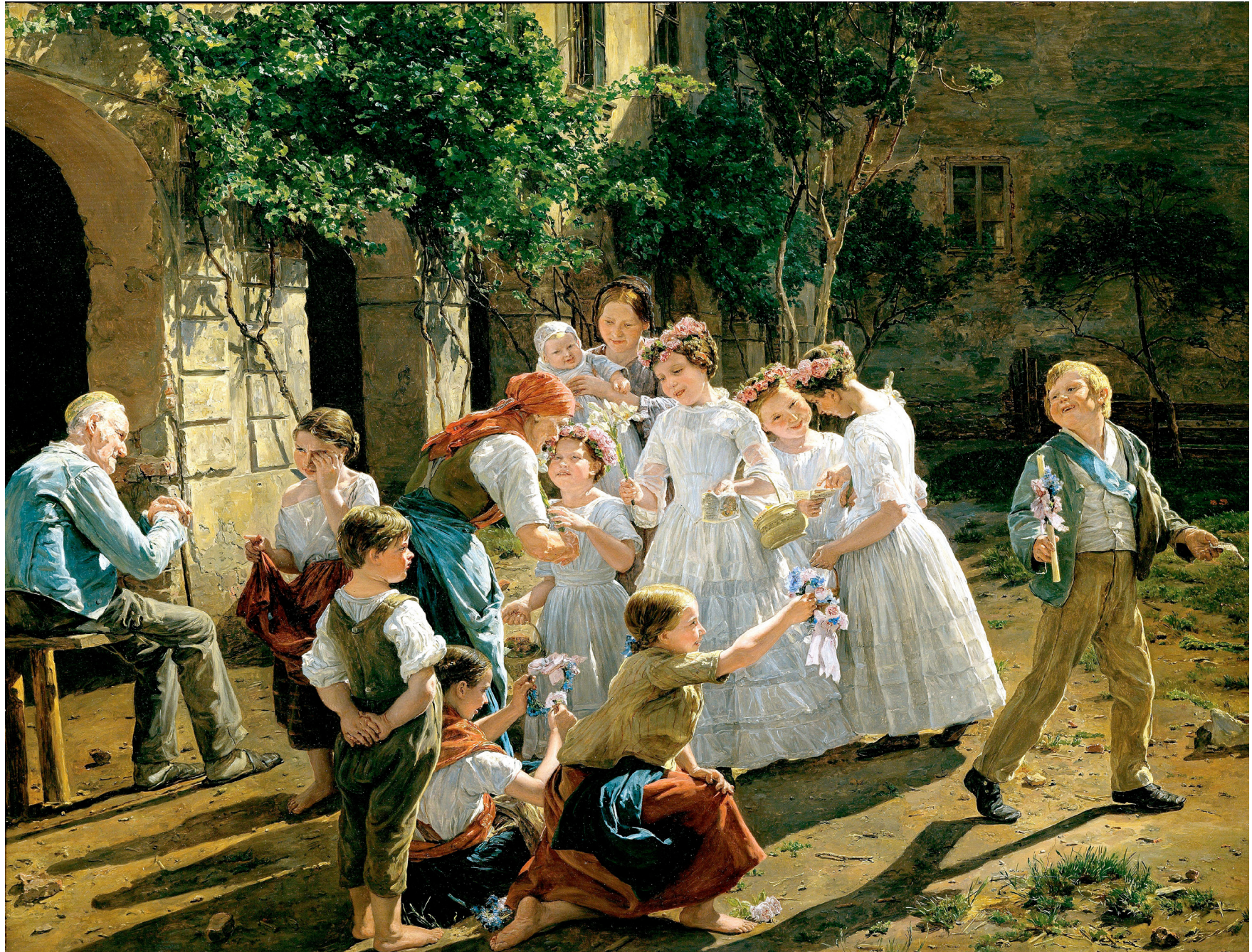
The Morning of the Feast of Corpus Christi (1857) Belvedere