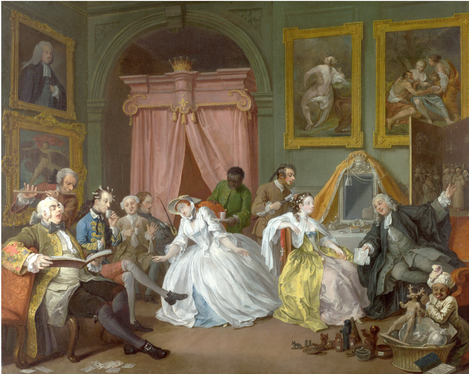
Marriage A-la-Mode: 4, The Toilette (c1743) National Gallery