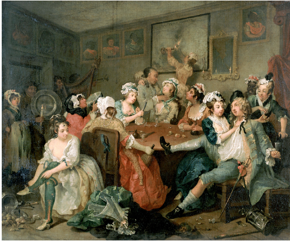
A Rake's Progress - Tavern Scene (c1730-31) Sir John Soane's Museum