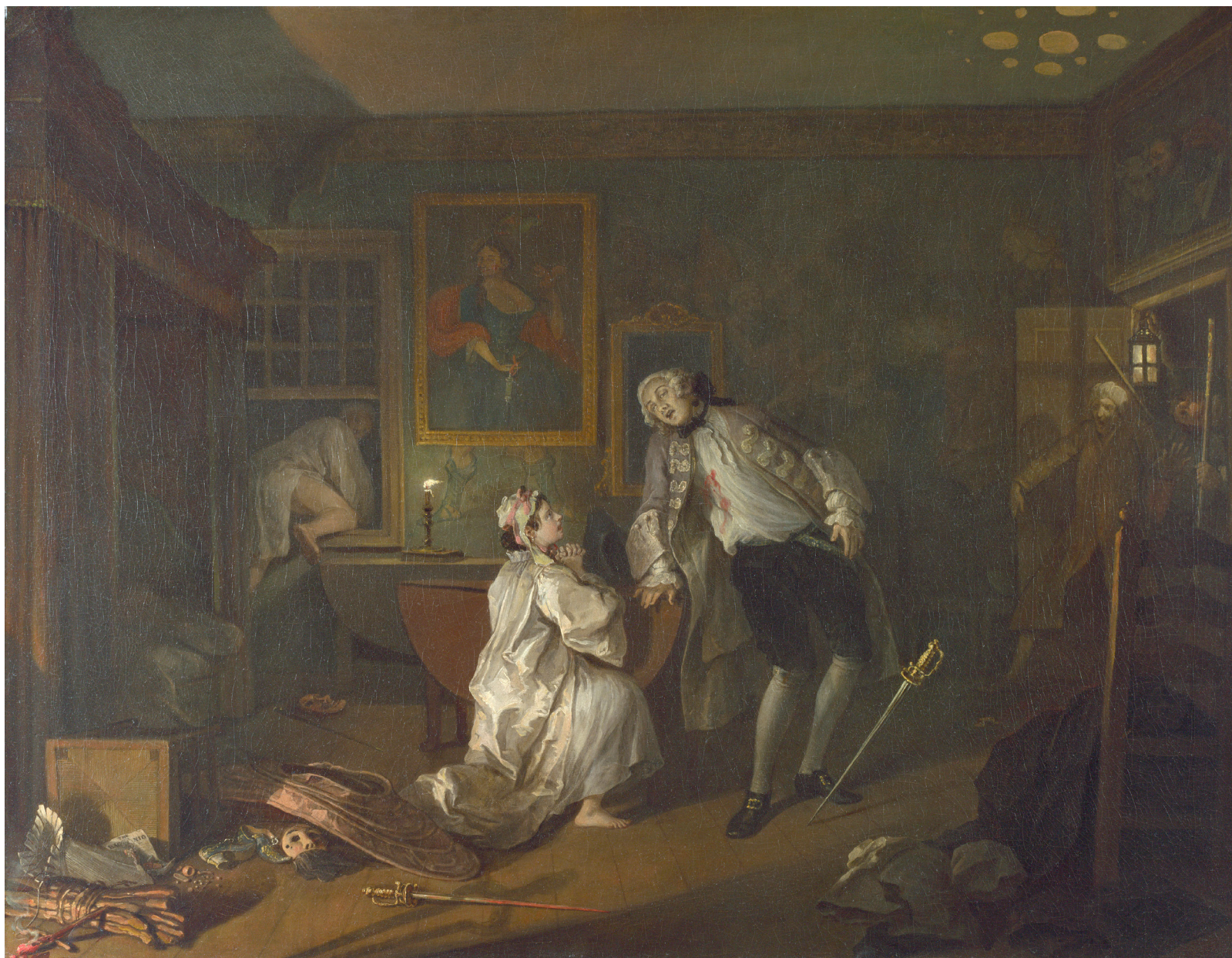
Marriage A-la-Mode: 5, The Bagnio (c1743) National Gallery