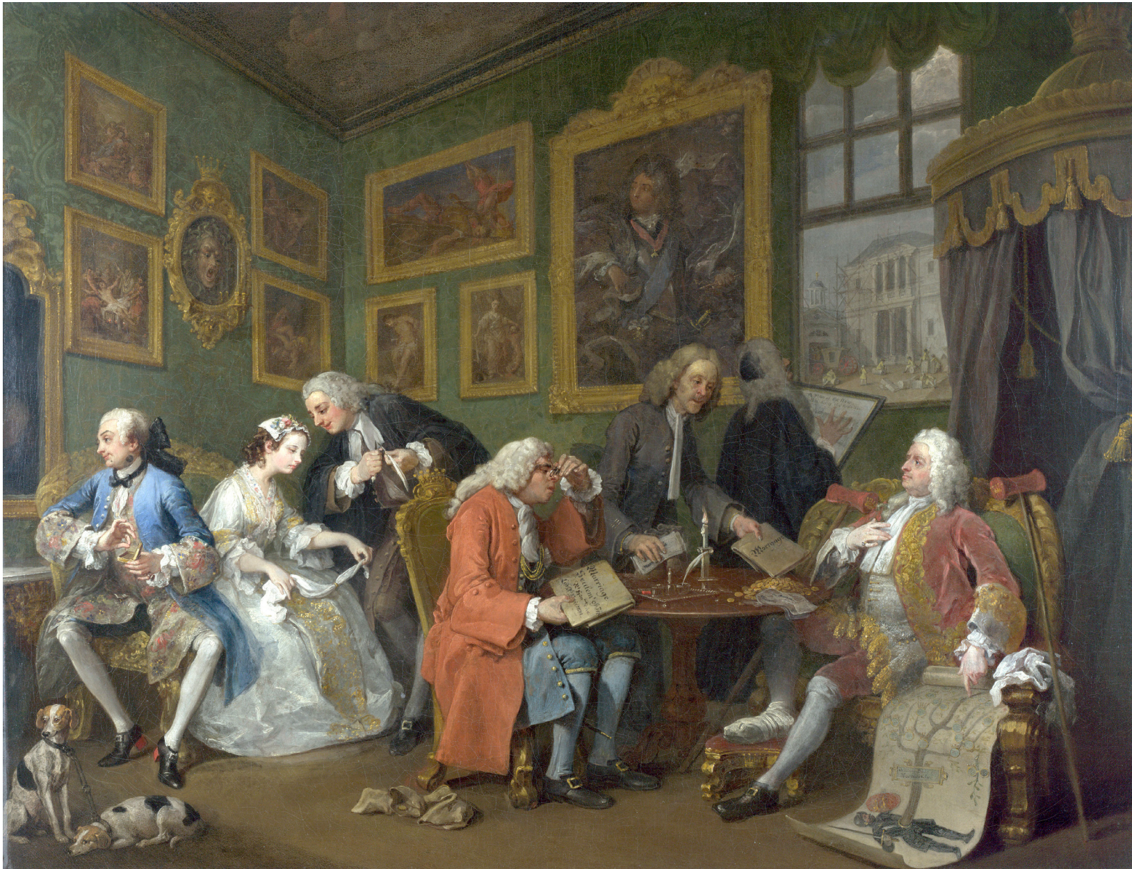
Marriage A-la-Mode: 1, The Marriage Settlement (c1743) National Gallery