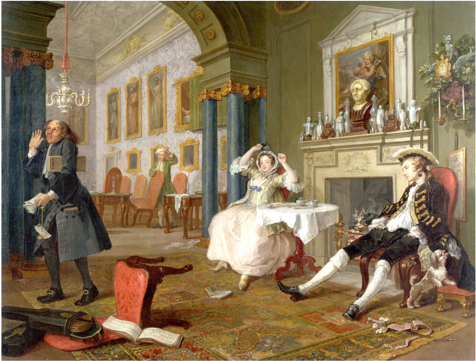
Marriage A-la-Mode: 2, The Tête à Tête (c1743) National Gallery