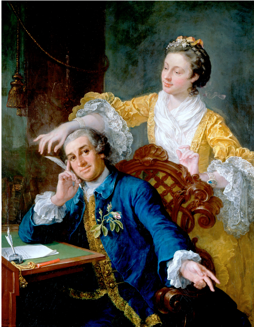
David Garrick with his Wife Eva-Maria Veigel (1757-64)