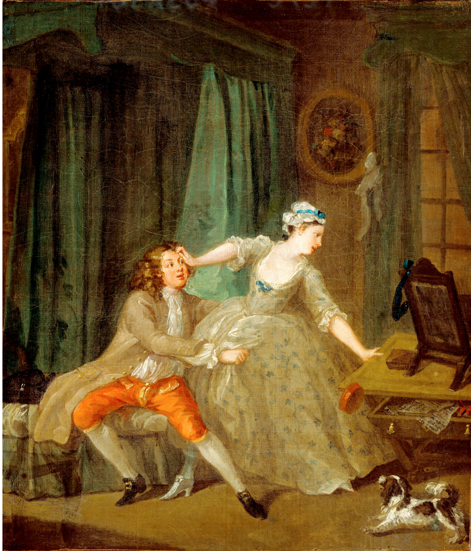
Before (c1730-31) Getty Center