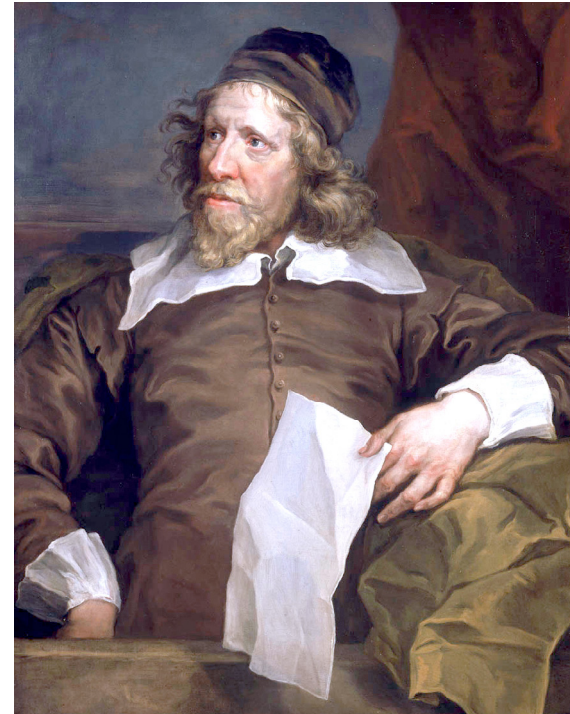
Inigo Jones (c1757) National Maritime Museum