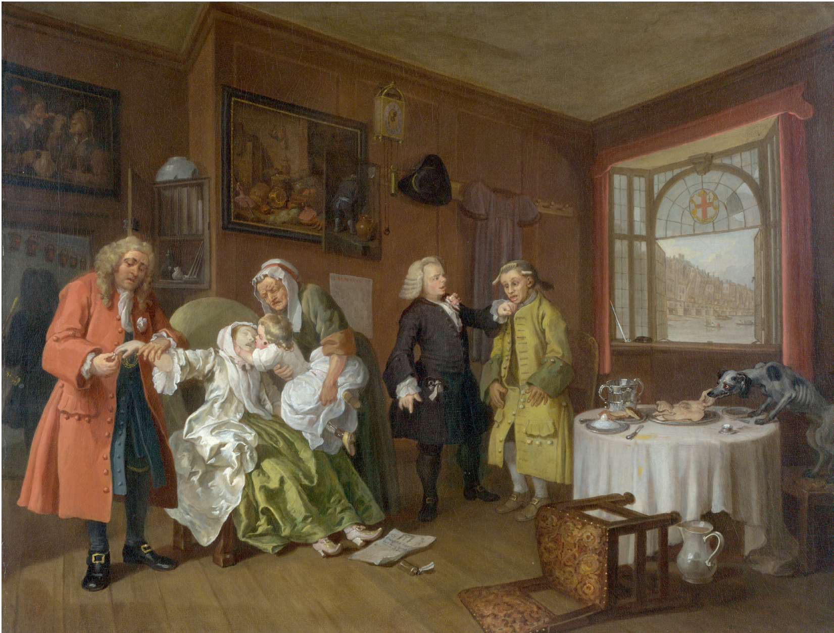
Marriage A-la-Mode: 6, The Lady's Death (c1743) National Gallery