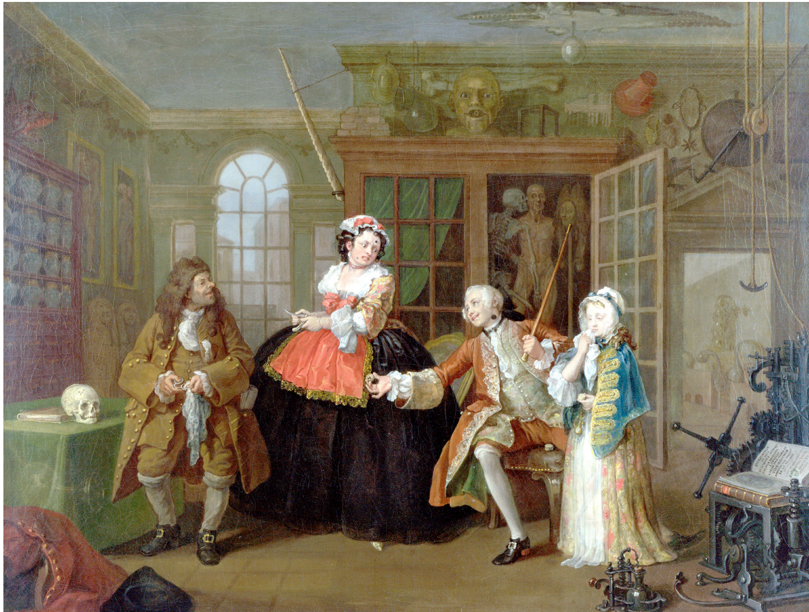
Marriage A-la-Mode: 3, The Inspection (c1743) National Gallery