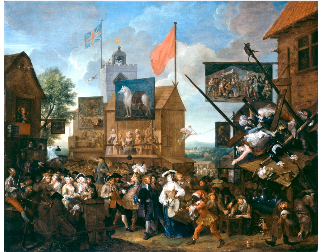
Southwark Fair (1733) Cincinnati Art Museum