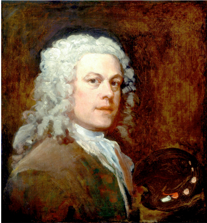
Self-portrait (c1735) Yale Center for British Art