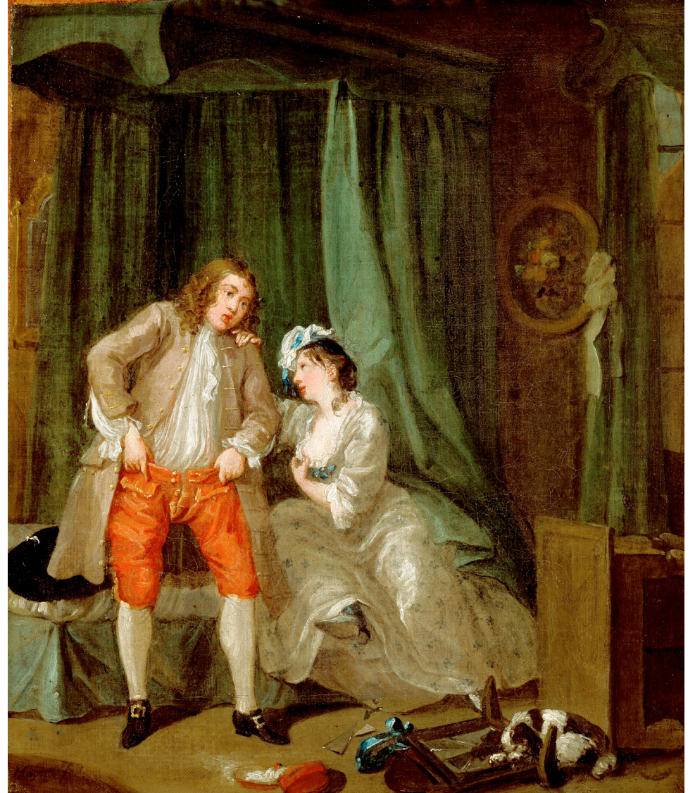
After (c1730-31) Getty Center