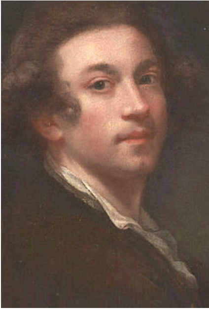
Self-Portrait (c1750) Yale Center for British Art