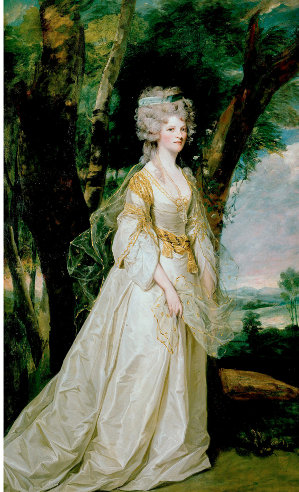
Lady Sunderland (1786) Gemäldegalerie