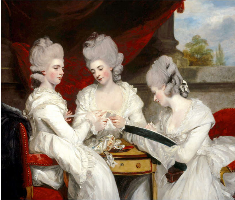
Ladies Walgrave (1780) Scottish National Gallery