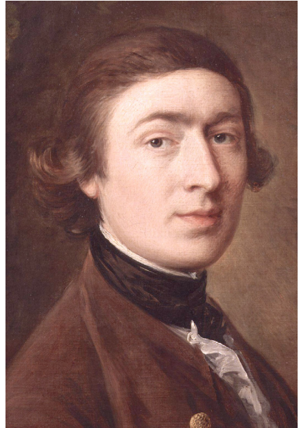
Self-Portrait (c1758) National Portrait Gallery