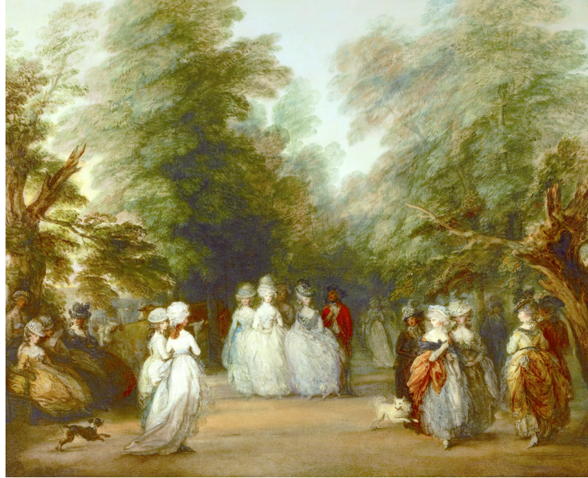
The Mall in St. James's Park (1783) The Frick Collection