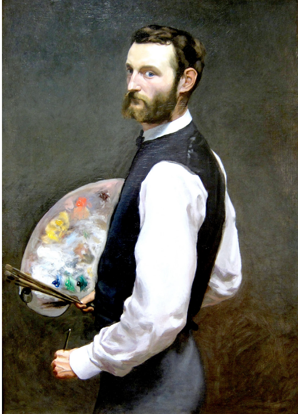
Self-Portrait (c1865) Art Institute of Chicago