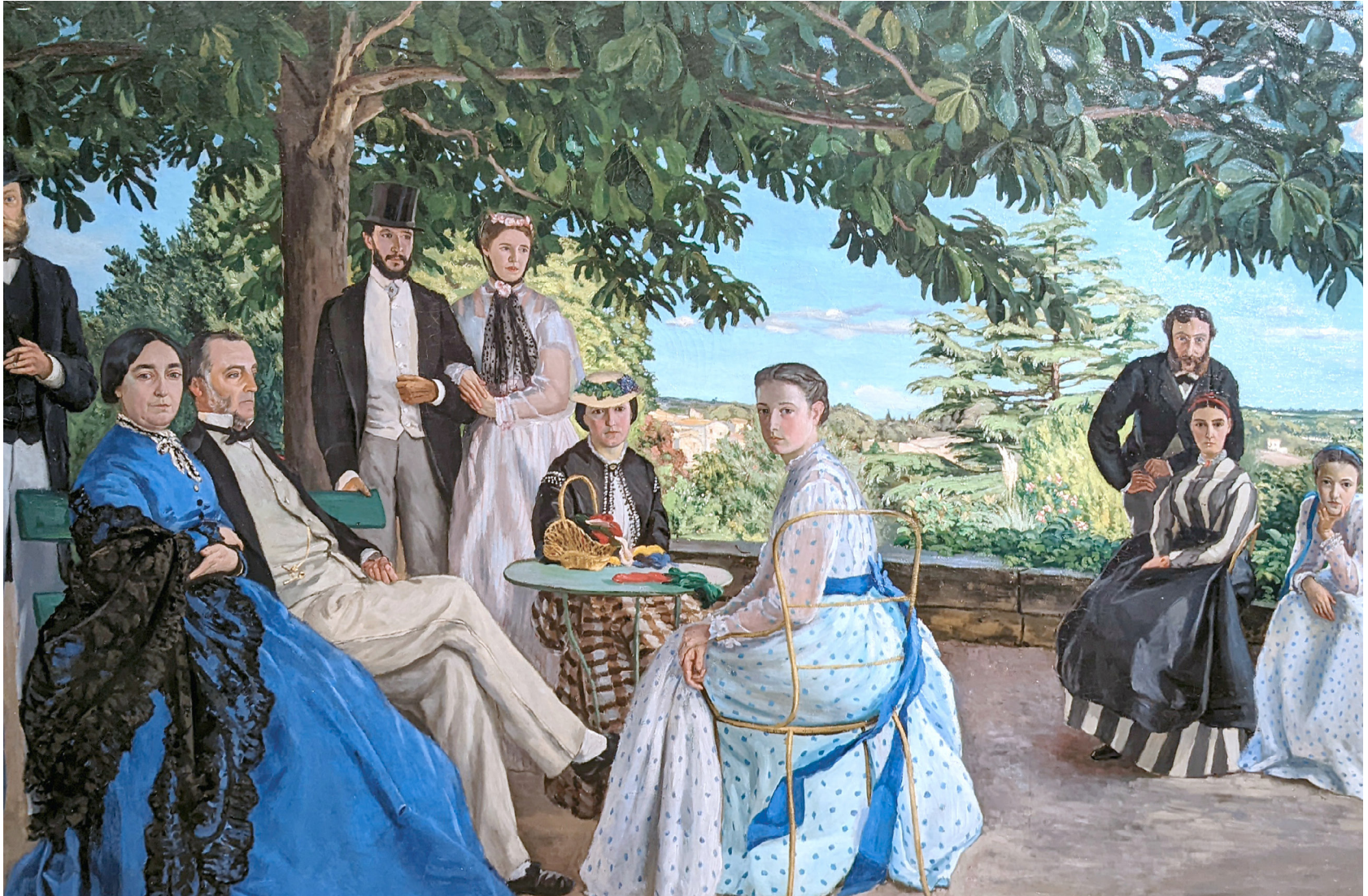
Réunion de Famille (1867-69) Musée d'Orsay