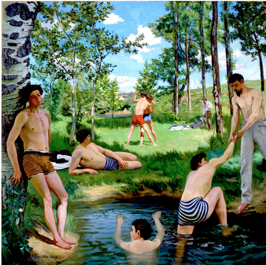
Scène d'été / Les Baigneurs (1869) Fogg Museum