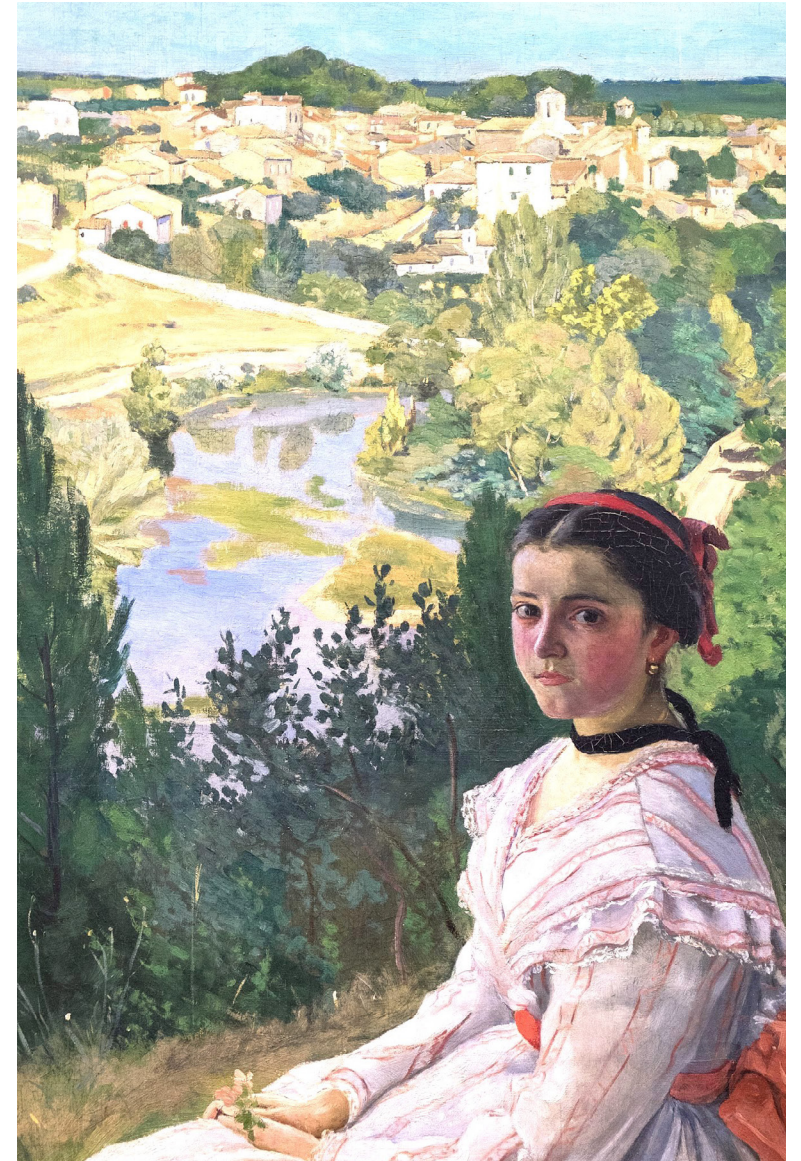
Vue du Village (1868) Fabre Museum