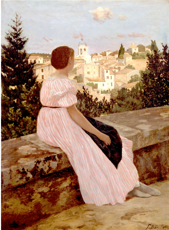
La Robe Rose (1864) Musée d'Orsay