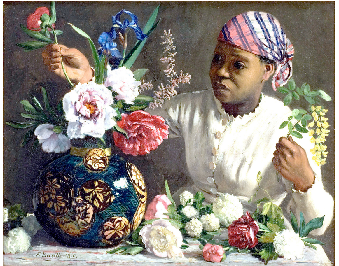
Jeune Fille Noire aux Pivoines (1870) Fabre Museum