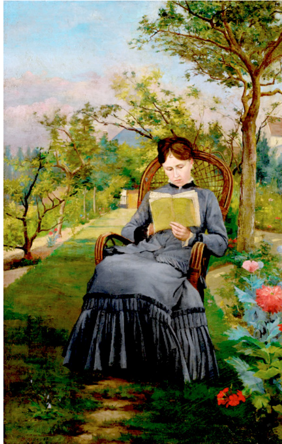
Thérèse Lisant dans le Parc de Méric (1867) CP