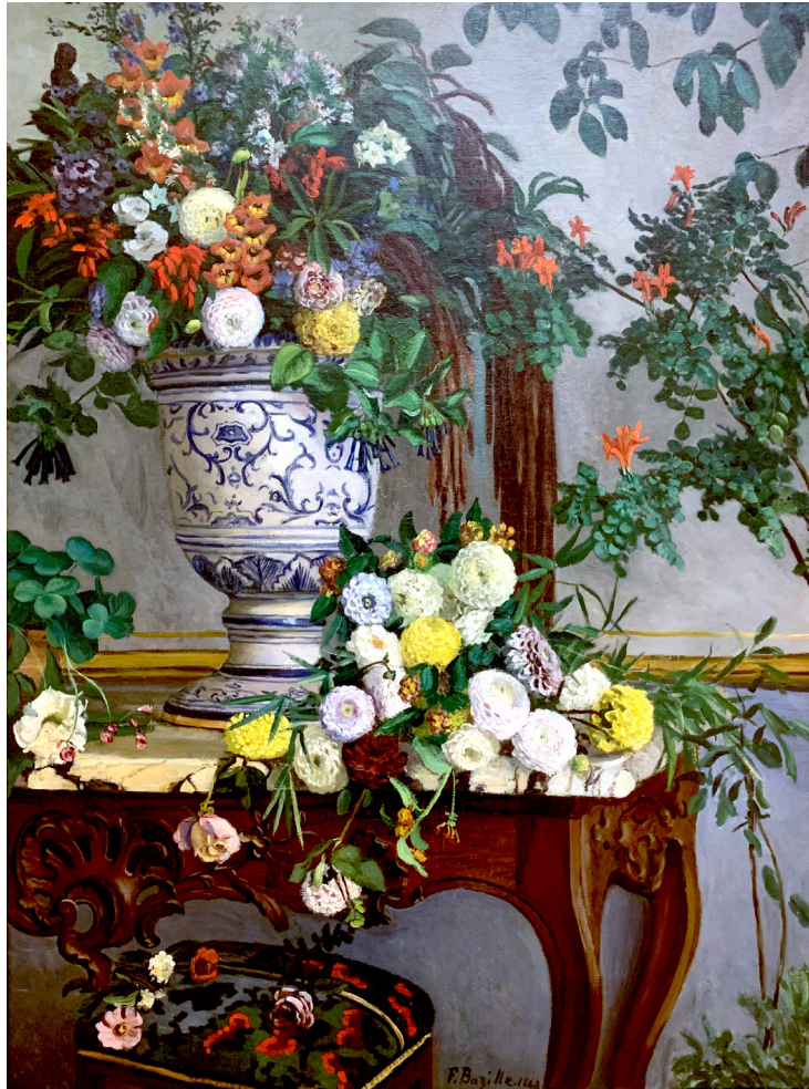
Fleurs (1868) Museum of Grenoble