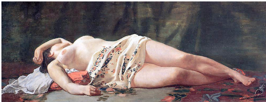
Nu Allongé (1864) Fabre Museum