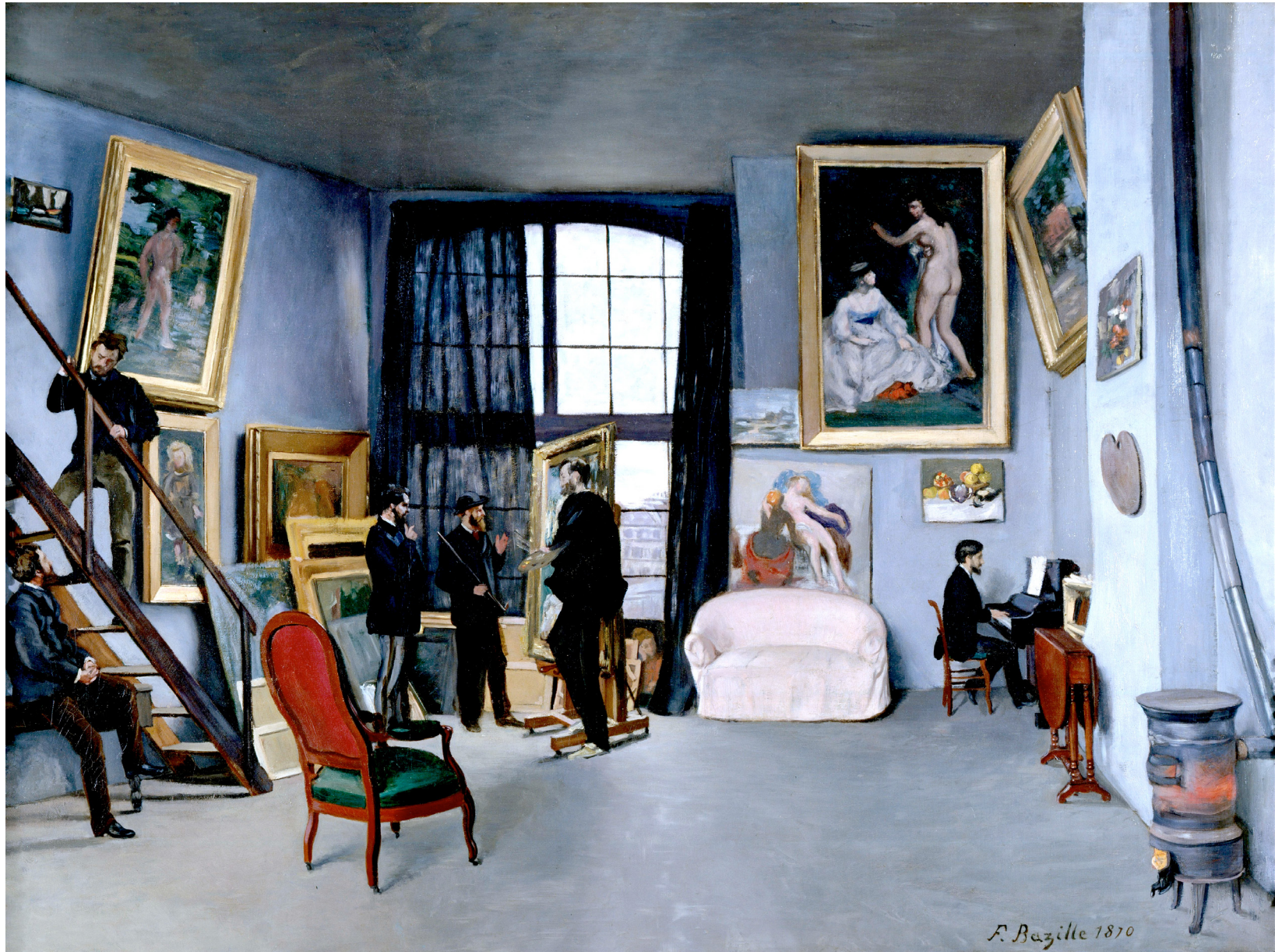
L'Atelier de Bazille (1870) Musée d'Orsay