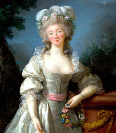
Madame du Barry (1782) National Gallery of Art