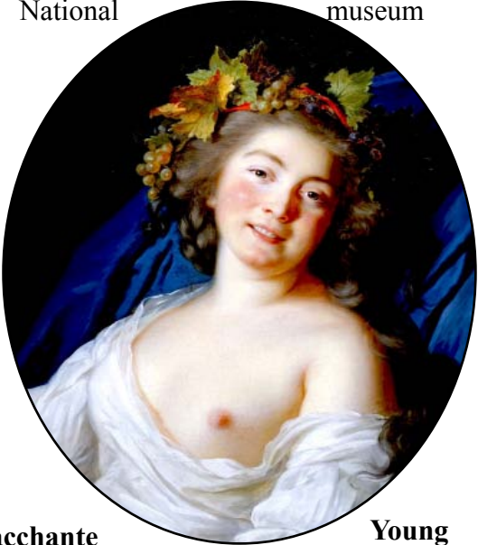
Bacchante (1785) Clark Art Institute