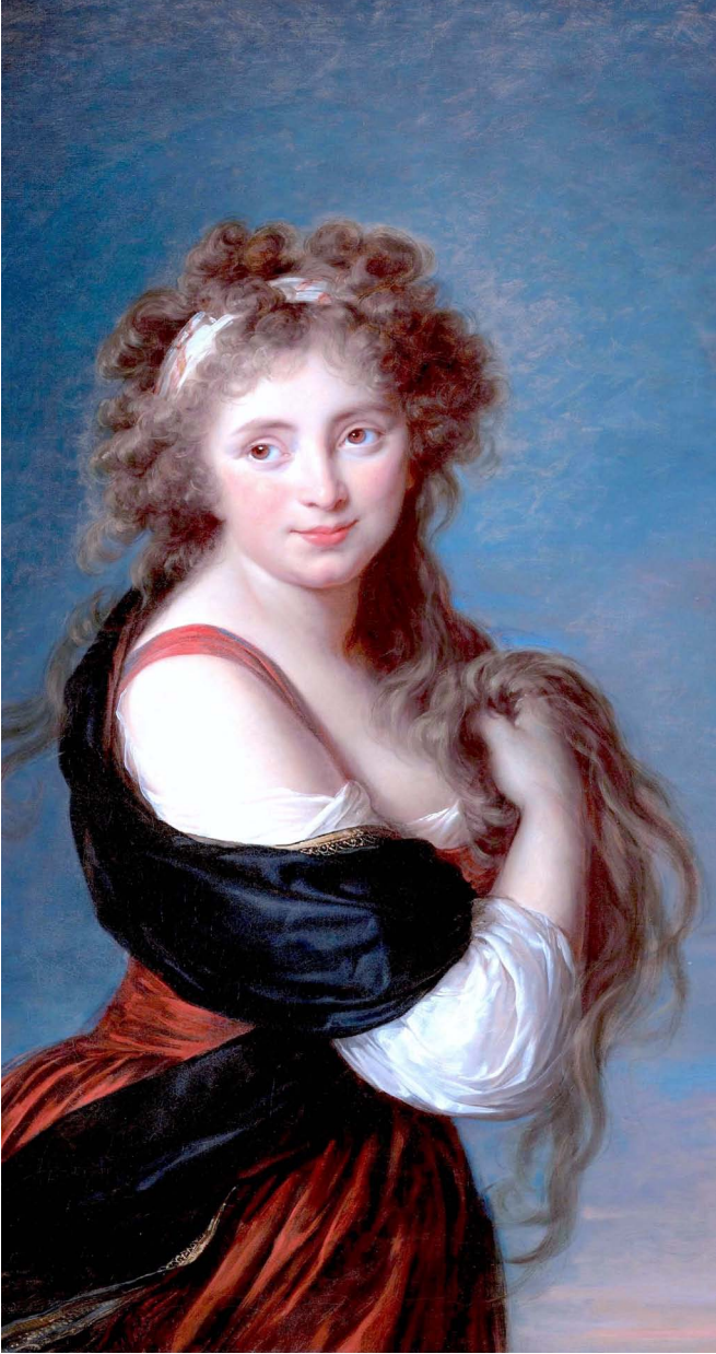
Hyacinthe-Gabrielle Roland (1791) Fine Arts Museums of San Francisco