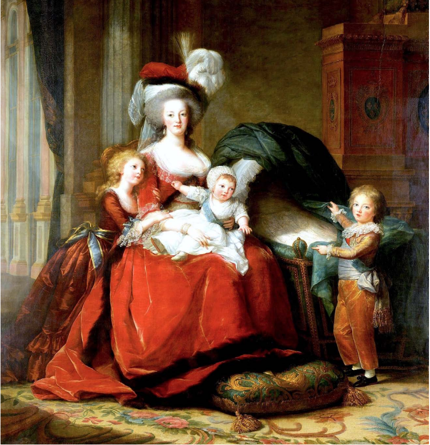
Marie-Antoinette with her Children (1787) Palace of Versailles