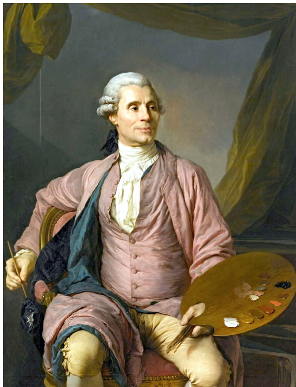
Portrait (Duplessis 1784) Louvre Museum