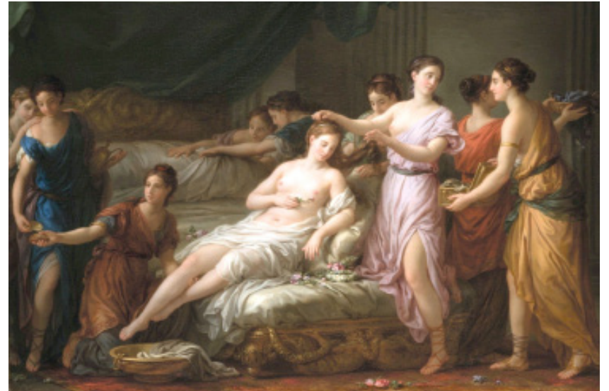
Women in Classical Dress Attending a Young Bride (1777)