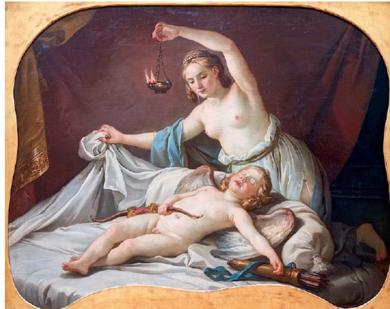
Psyche Recognizing Sleeping Love (1761) Palais des Beaux-Arts de Lille