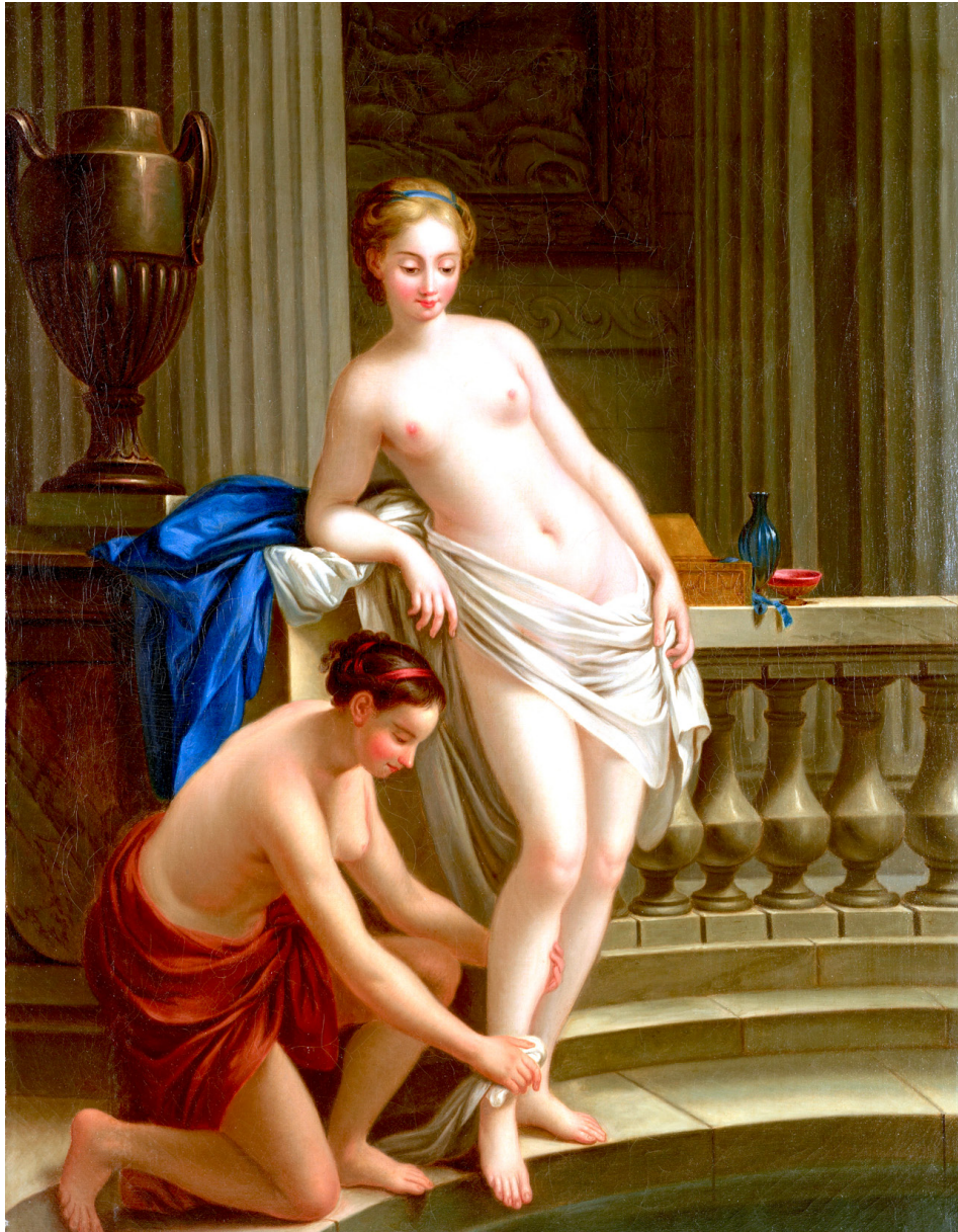
Greek Women at the Bath (c1767) Museo de Arte de Ponce