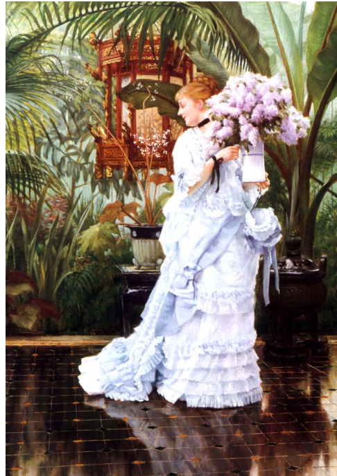
The Bunch of Lilacs (c1875) CP