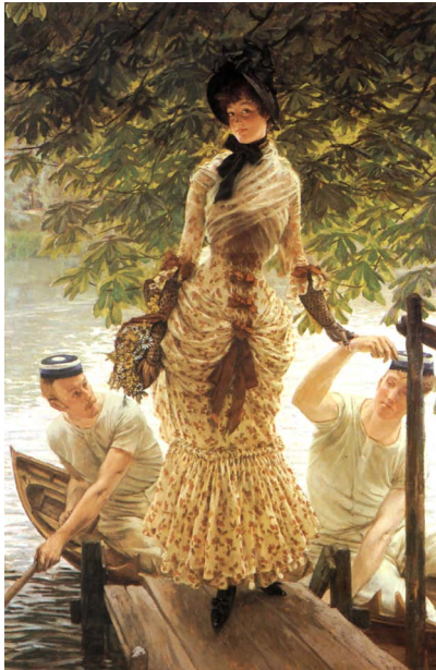
On the Thames (c1874)