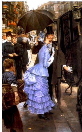
The Bridesmaid (1883-85) CP