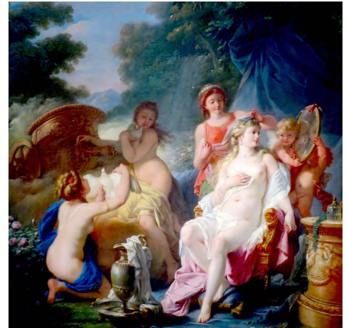
Toilet of Venus (??) Pushkin Museum