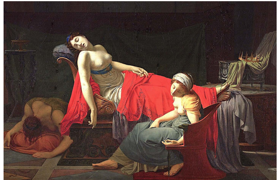
Death of Cleopatra (1796-97) Museum Kunstpalast