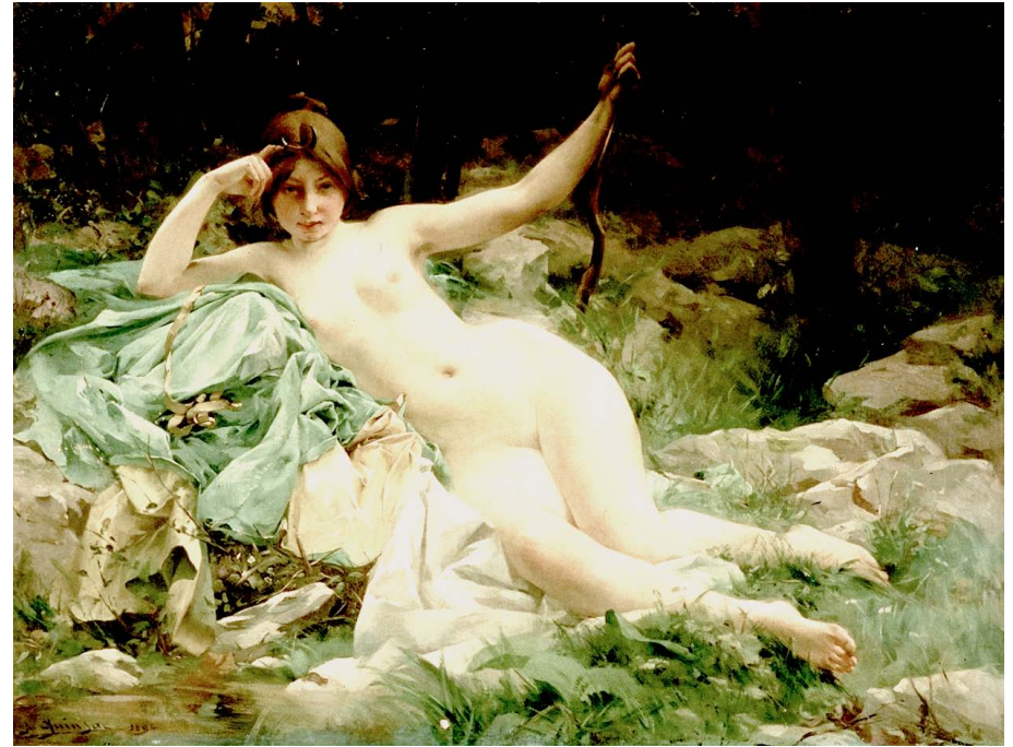
Diane (1895)