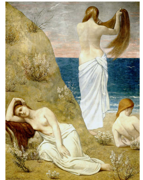
By the Seaside (1879) Musée d'Orsay