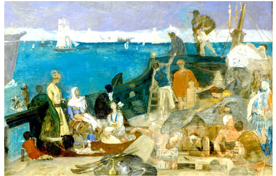
Marseilles, Gateway to the Orient (1868) The Phillips Collection