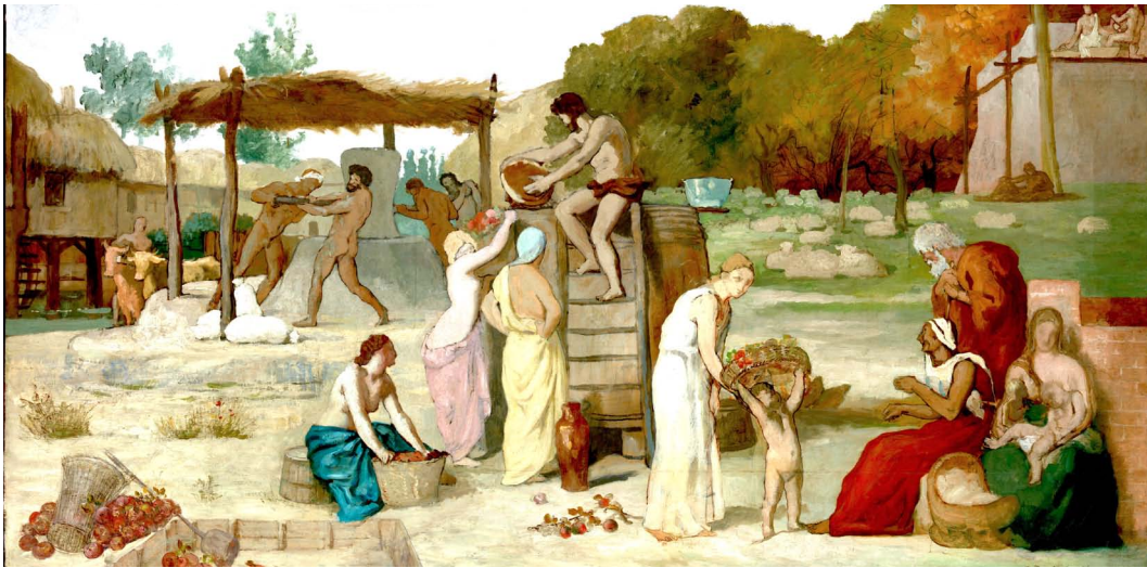
Cider (c1864) Metropolitan Museum of Art