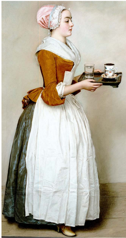
The Chocolate Girl (1744) Staatliche Kunstsammlungen Dresden