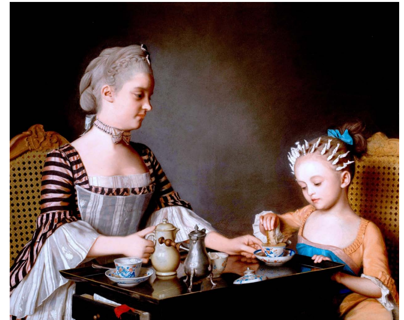
Lavergne Family Breakfast (1754) National Gallery