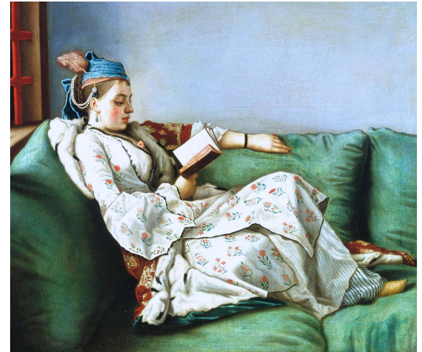
Maria Adelaide of France in Turkish-style clothes (1753) Uffizi Gallery