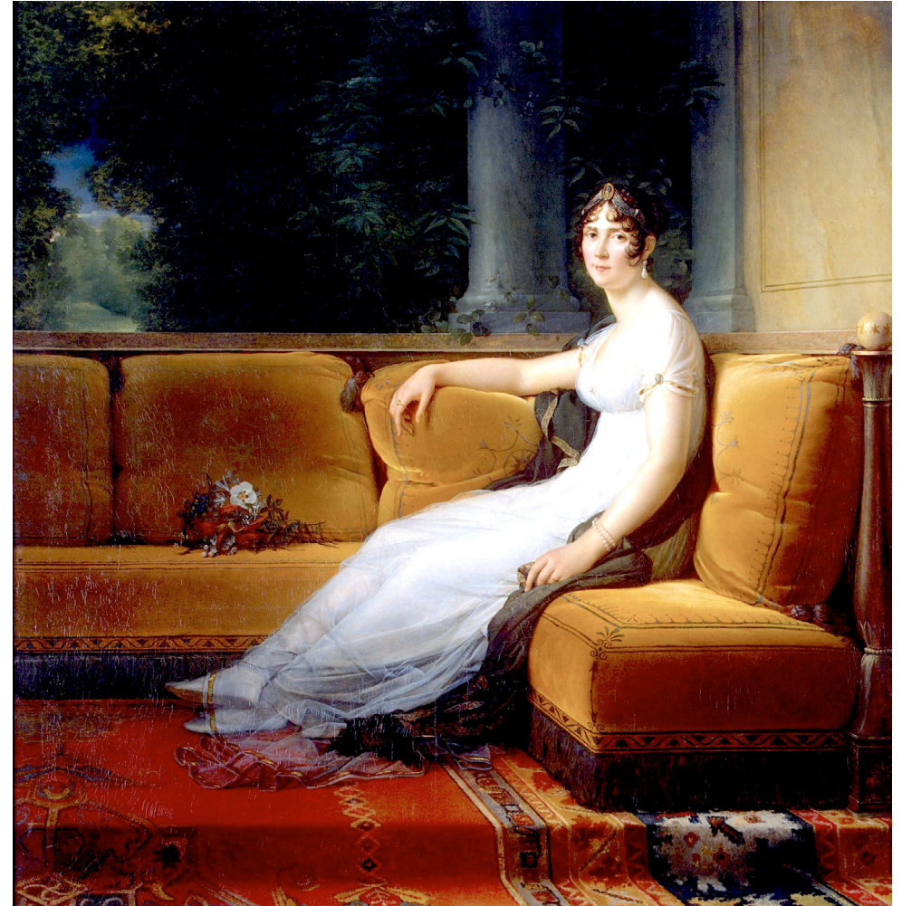
Josephine de Beauharnais (1801) Hermitage Museum