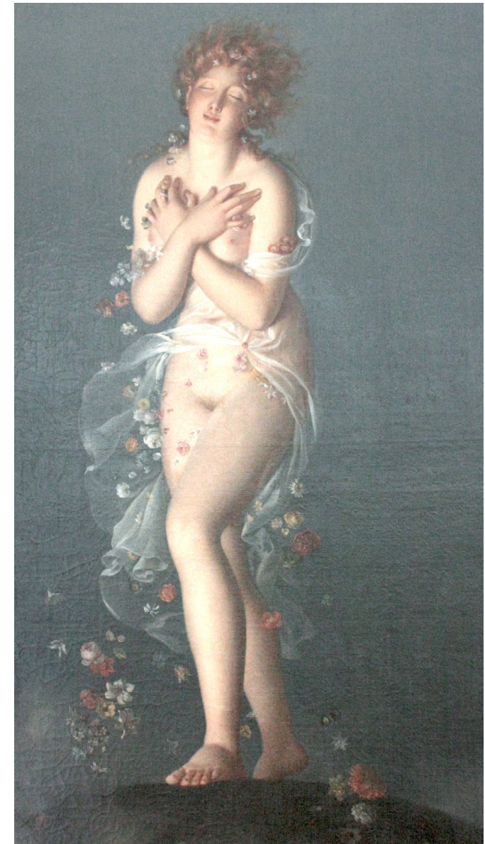
Flora Caressed by Zéphyr (1802) Museum of Grenoble