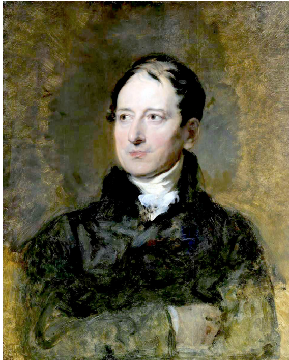
Portrait (Lawrence 1824) Palace of Versailles