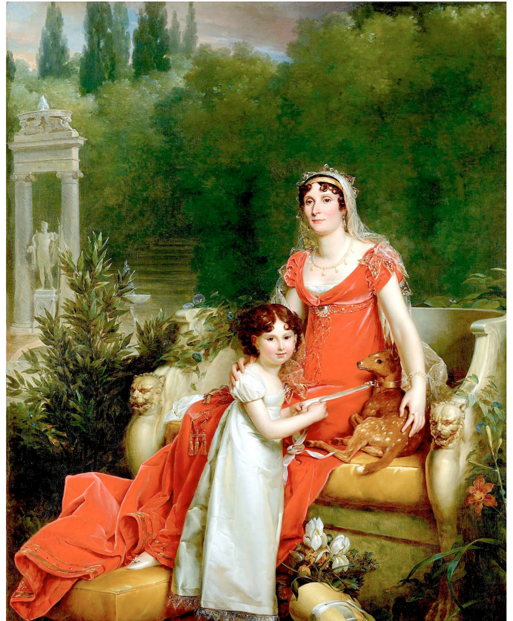
Elisa Bonaparte with her Daughter Napoleona (1810) Napoleonic Museum