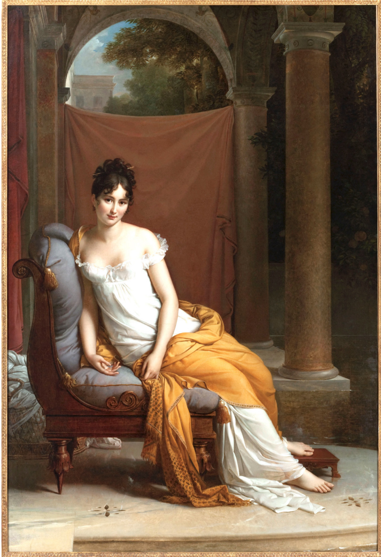
Juliette Récamier (1802-05) Musée Carnavalet