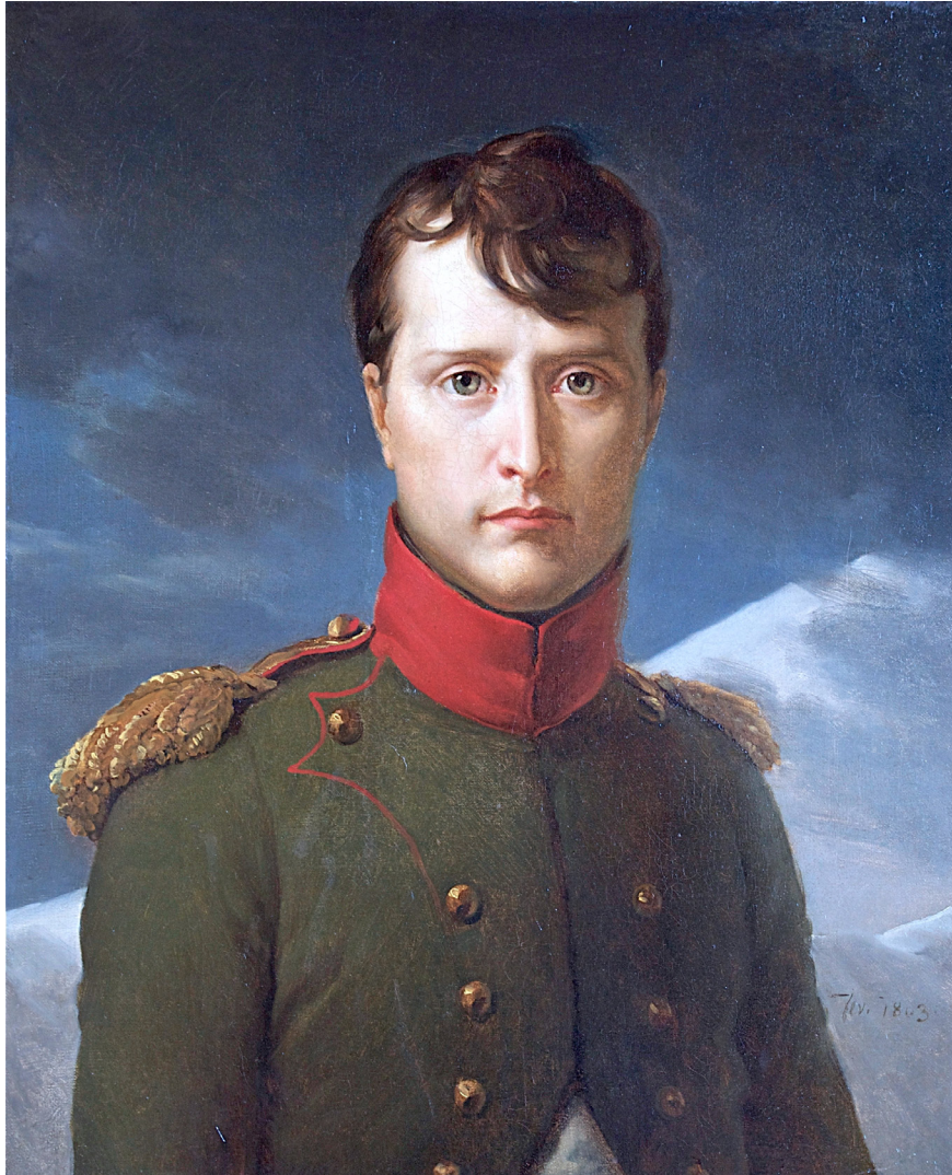
Napoléon Bonaparte Premier Consul (1803) Condé Museum