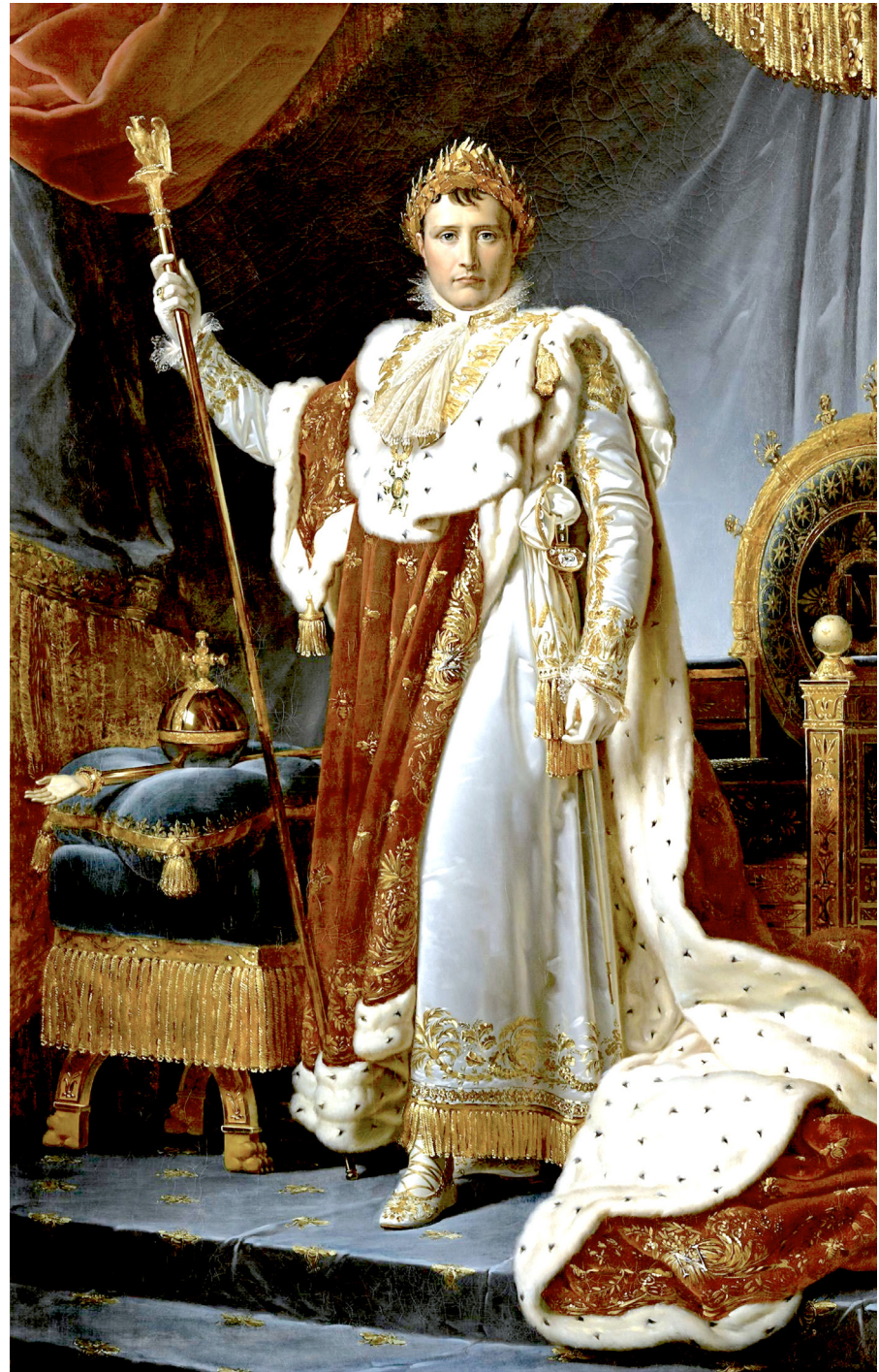
Emperor Napoleon I (1805-15) Rijksmuseum