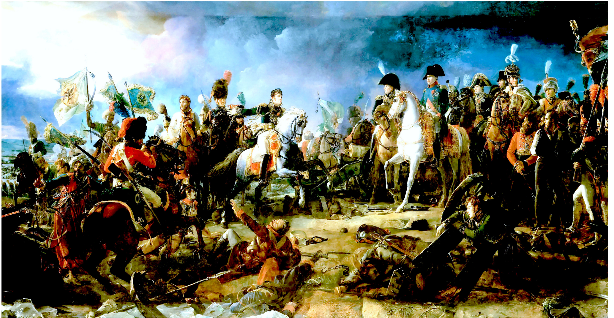
The Battle of Austerlitz, 2nd December 1805 (1810) Musée de Trianon