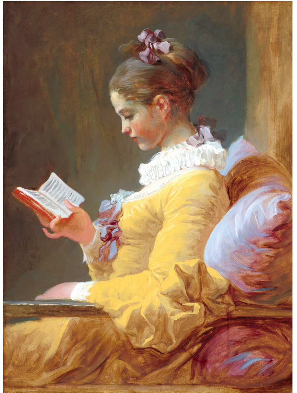
Interesting Student (c1785-87) Louvre Museum