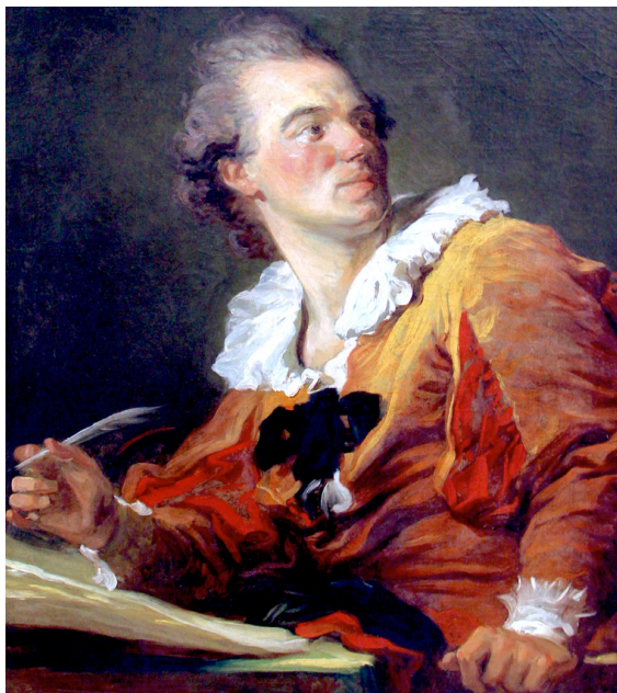
Inspiration (1769) Louvre Museum