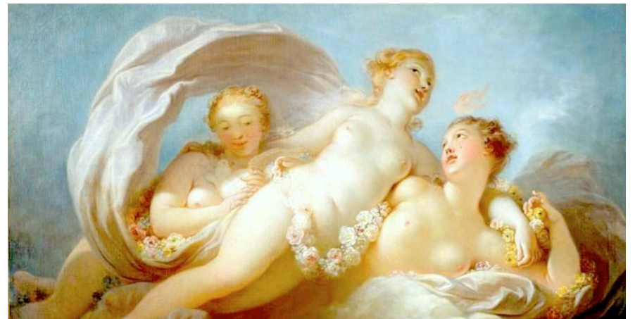
Three Graces (1770s) CP