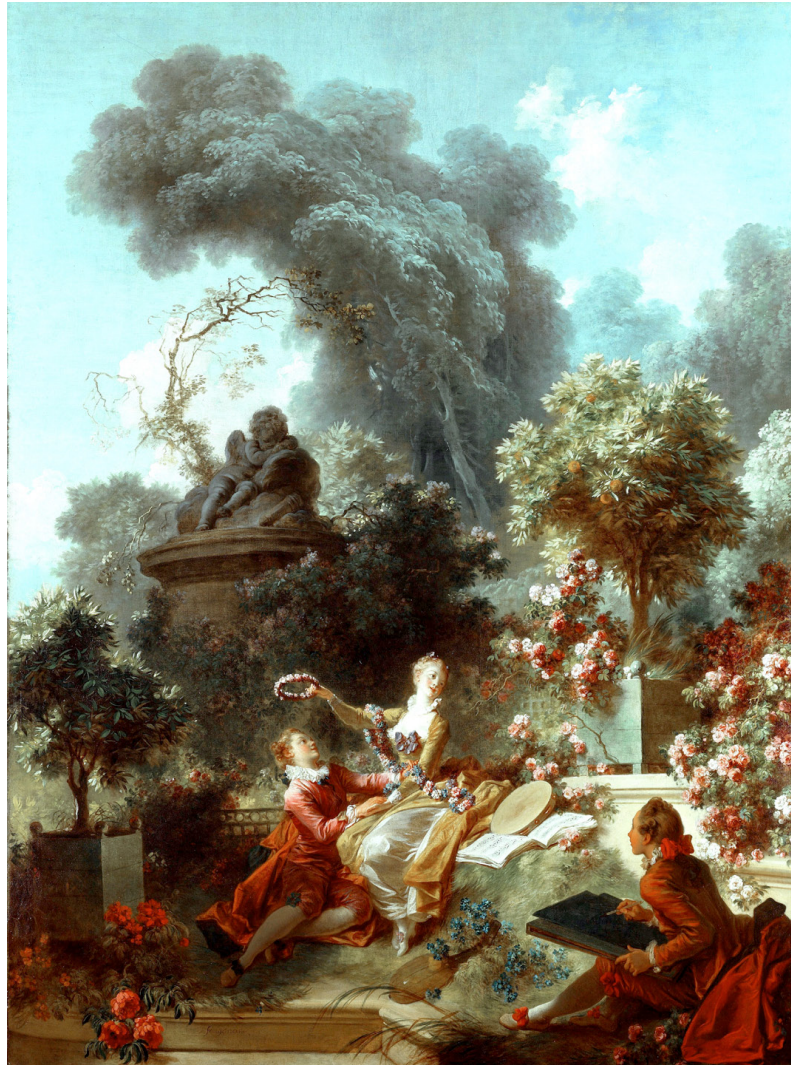
The Lover Crowned