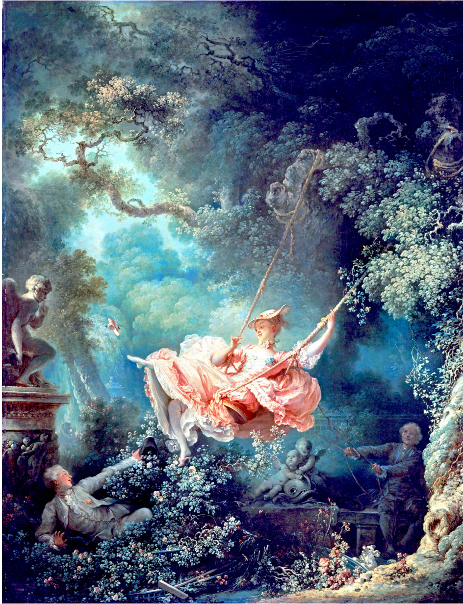
Happy Accidents of the Swing (1767-68) Wallace Collection