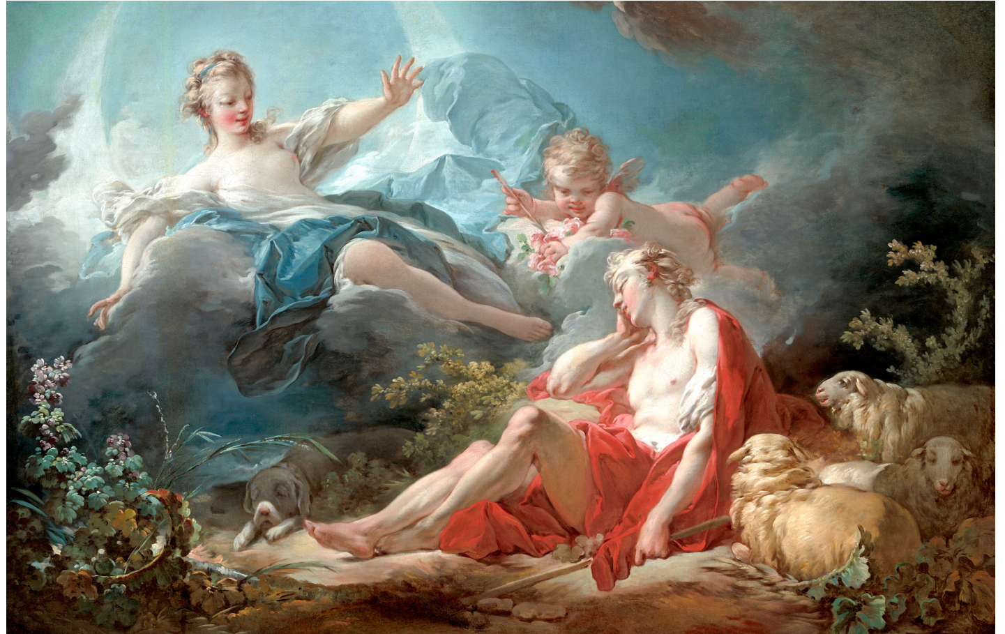
Allegory of Vigilance (c1772) Metropolitan Museum of Art