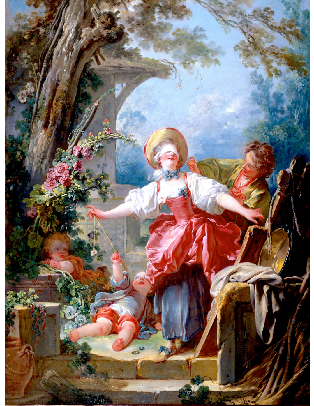
Blind-Man's Buff (1750-52) Toledo Museum of Art