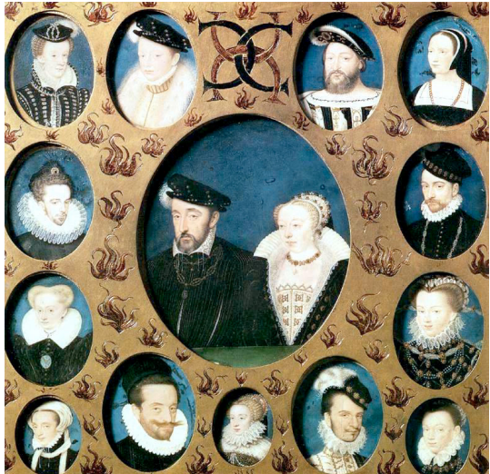
Henry II, Caterina de' Medici and Family (c1560) Uffizi