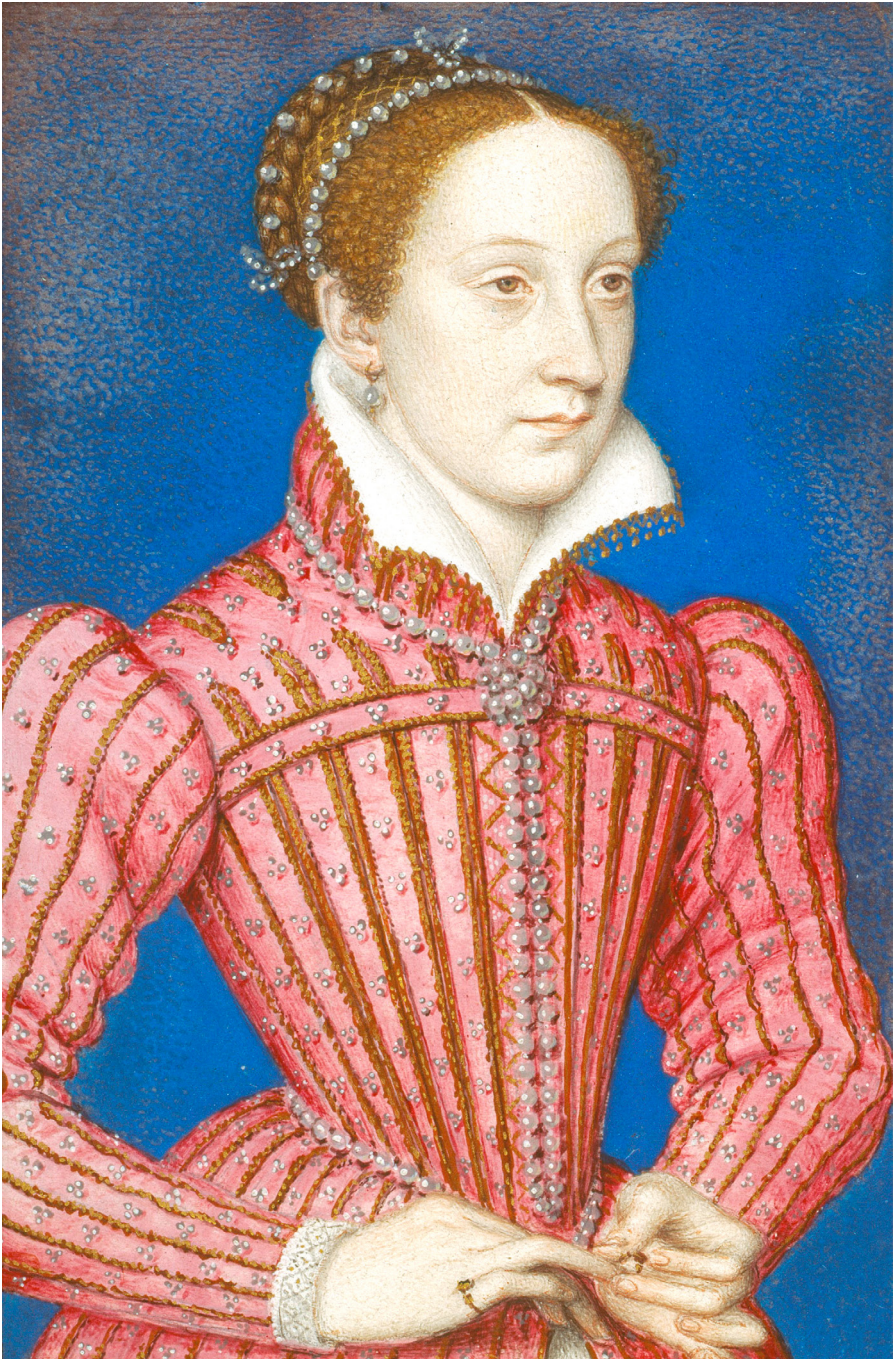
Mary, Queen of Scots (1558-60)