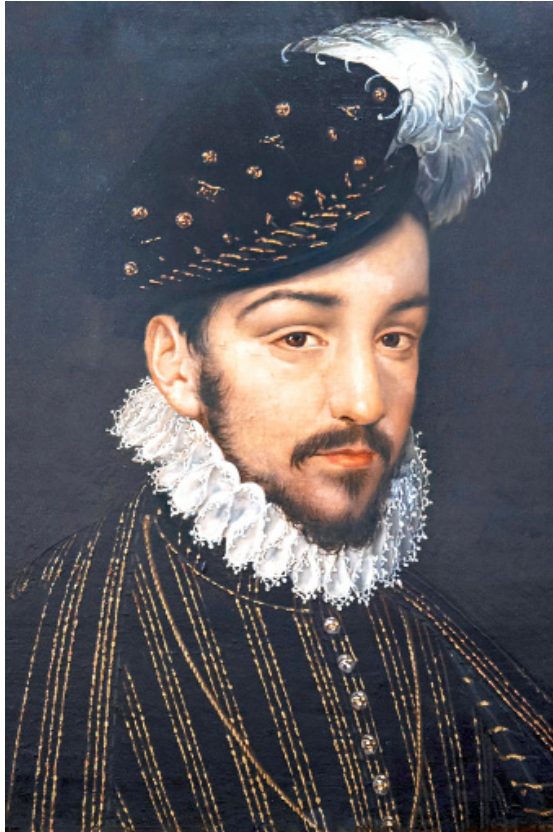
King Charles IX (Circle c1573) Musée des Beaux-Arts d'Agen