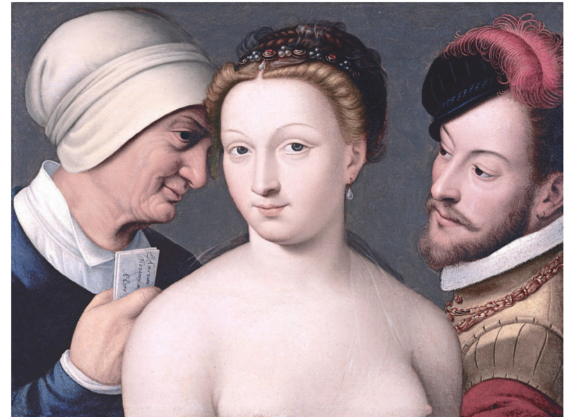
The Love Letter (c1570) Thyssen-Bornemisza Museum