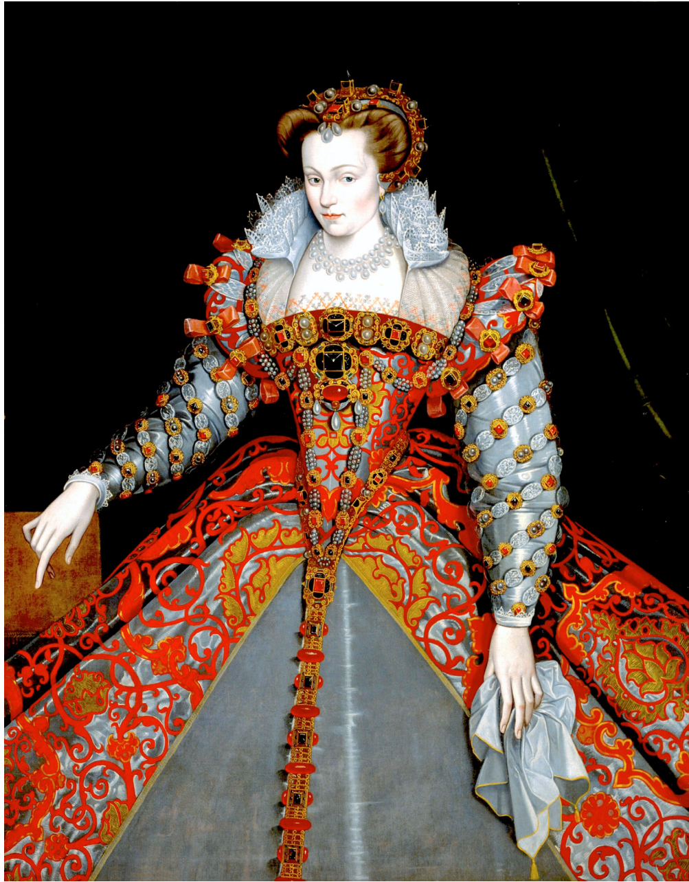
Louise de Lorraine Wife of Henry III (c1575) Museum of Fine Arts, Houston