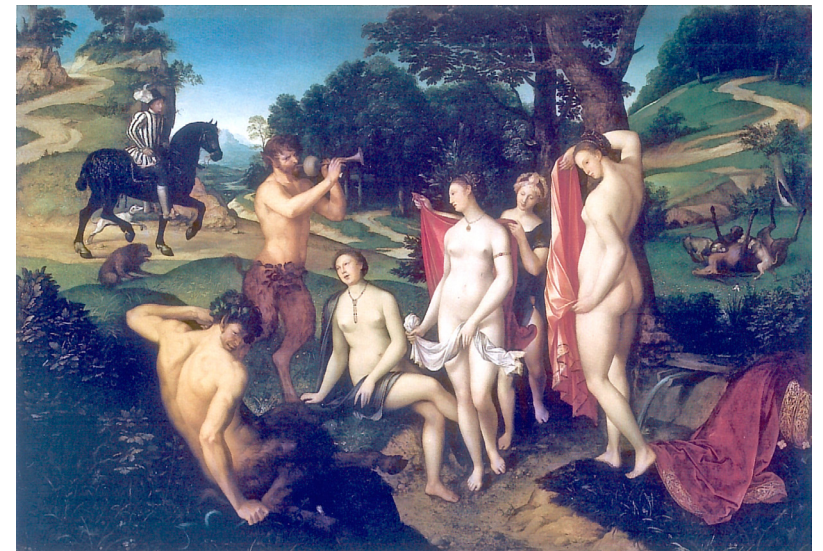
Diana Bathing (c1558-59) Musée des Beaux-Arts de Rouen