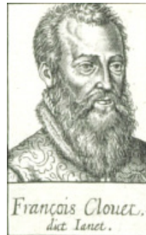
François Clouet (Gaultier 1582) Bibliothèque nationale de France