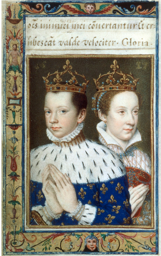
Francis II and Mary (c1560)