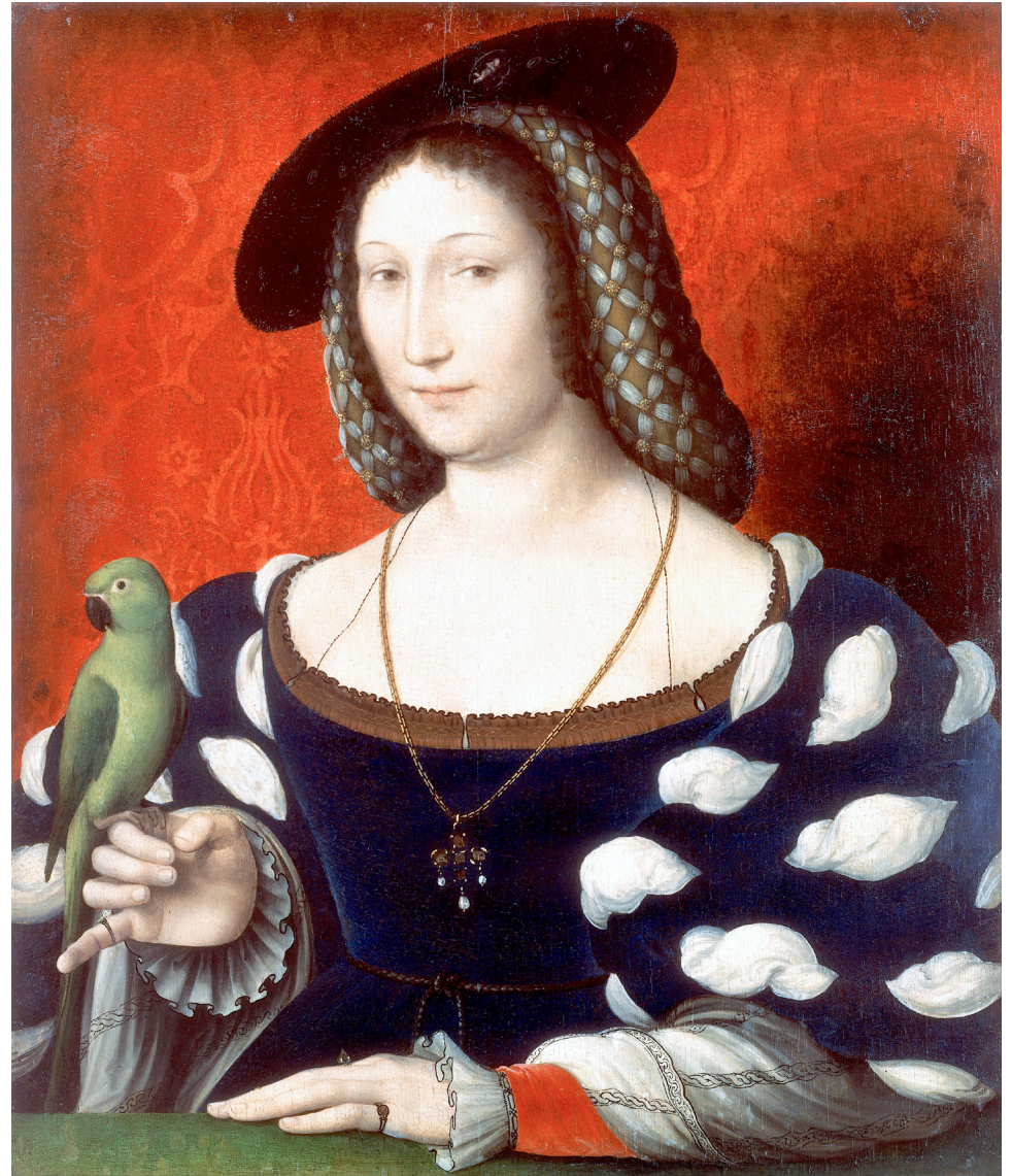
Marguerite of Navarre (c1527) Walker Art Gallery