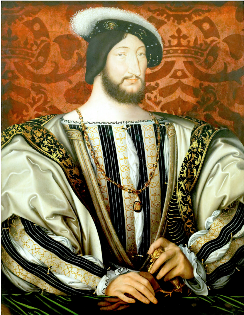
François I, king of France (1527-30) Louvre Museum