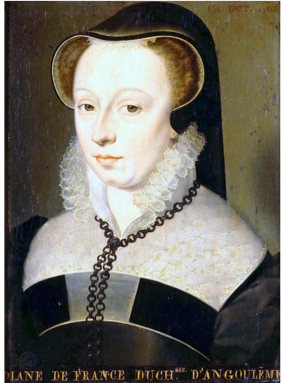
Diana de Valois (1568)