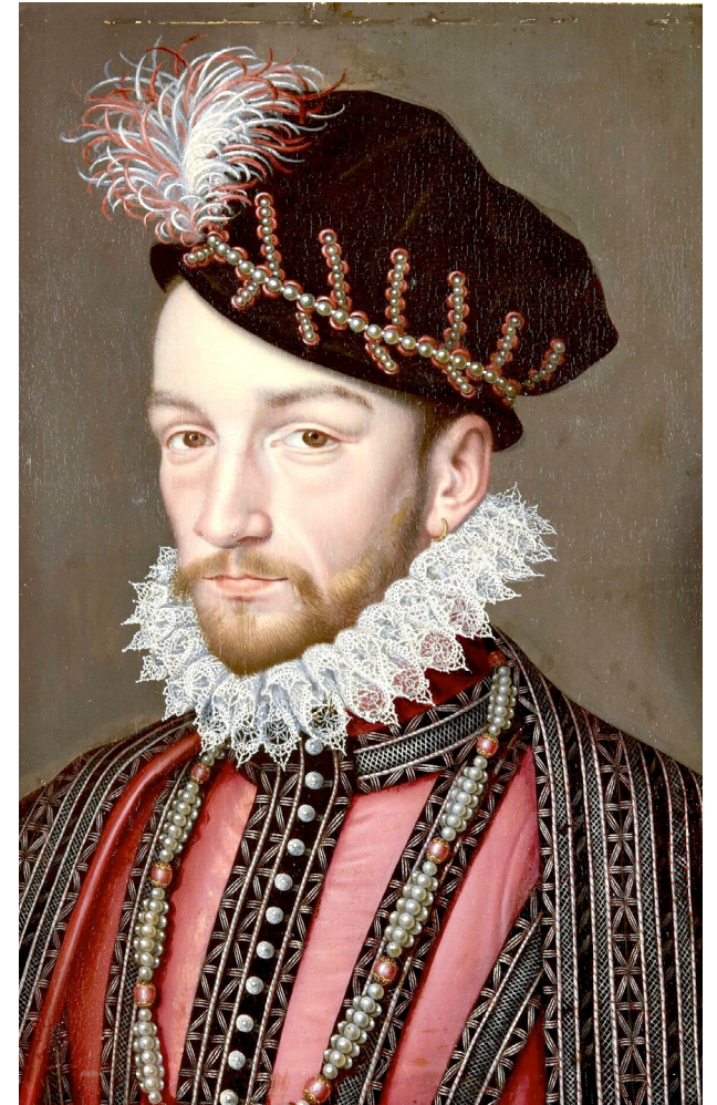
King Charles IX (c1573) Palace of Versailles