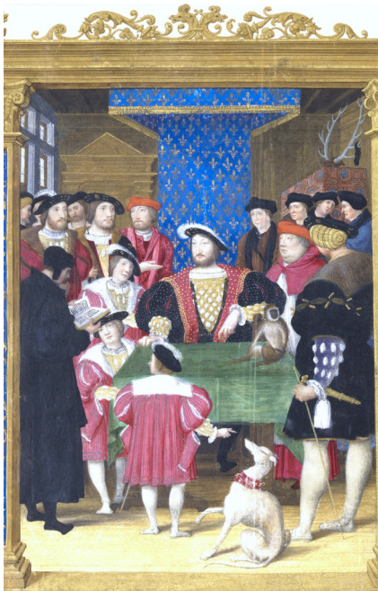
François I and his Court (1534) Condé Museum