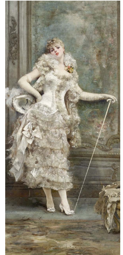
Frou-Frou (??) CP