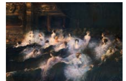
Opera (??) CP