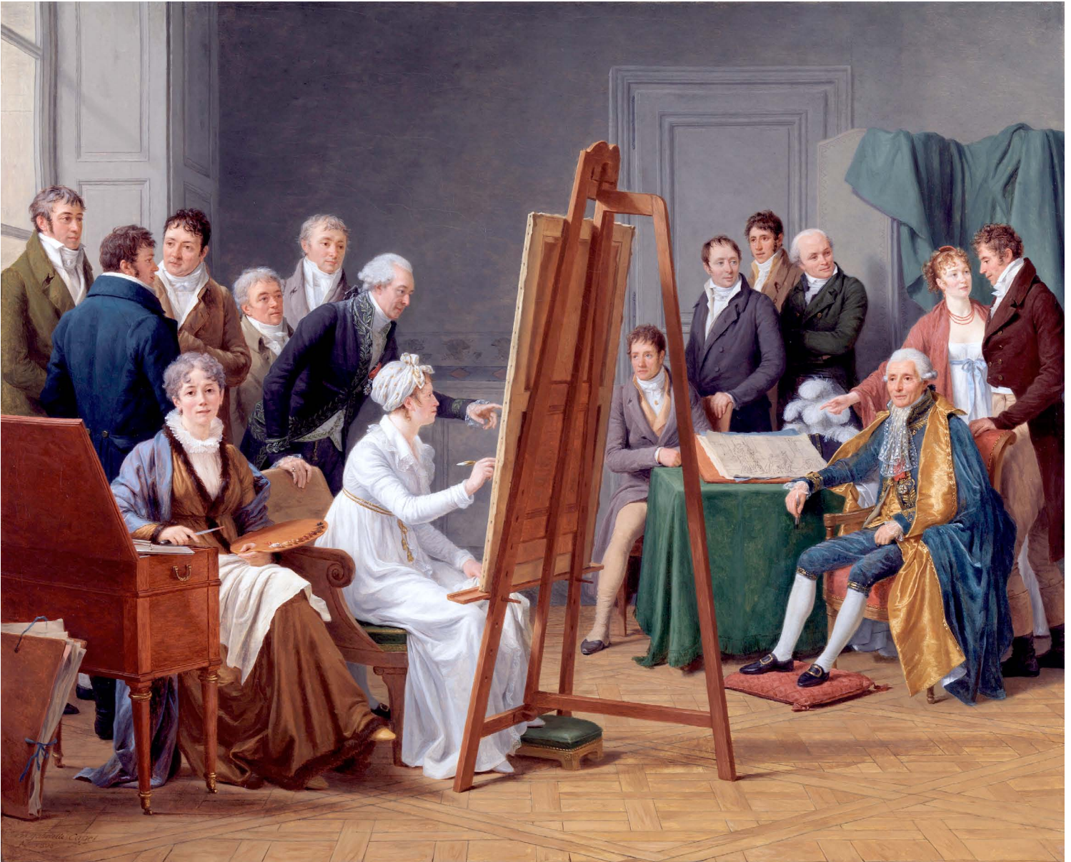
Autoportrait (c1783) National Museum of Western Art